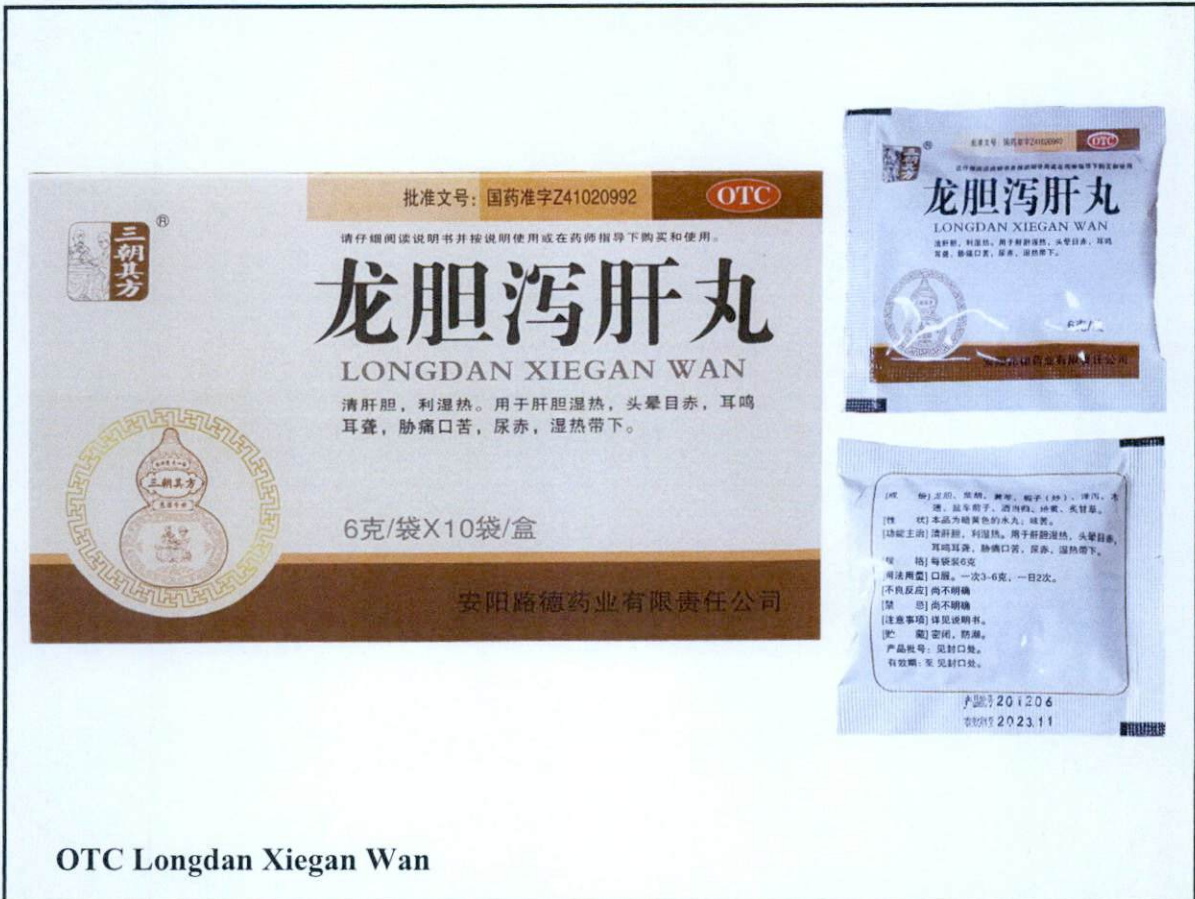
Figure 3. Unregistered drug product