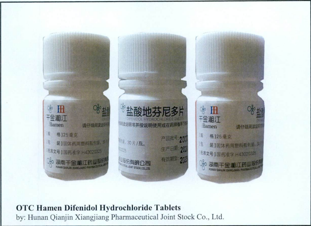
Figure 2. Unregistered drug product