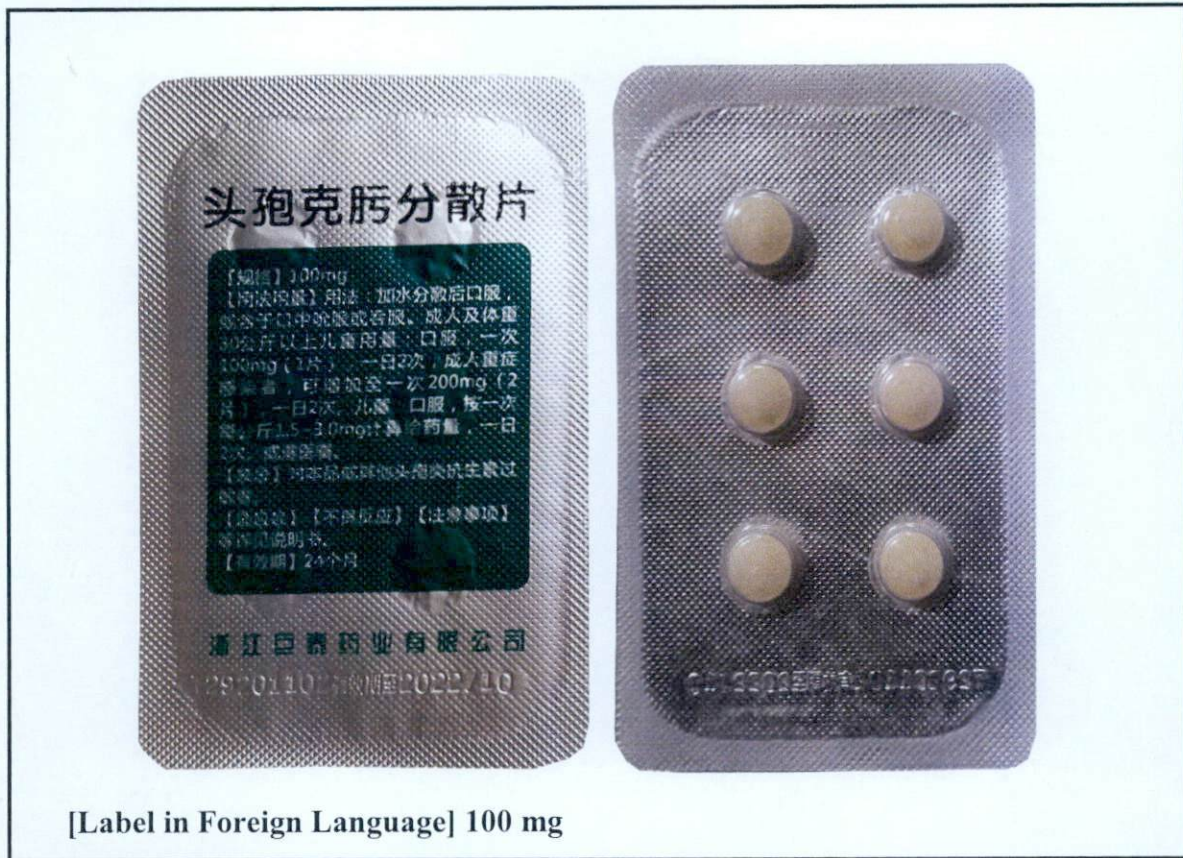
[Label in Foreign Language] 100 mg