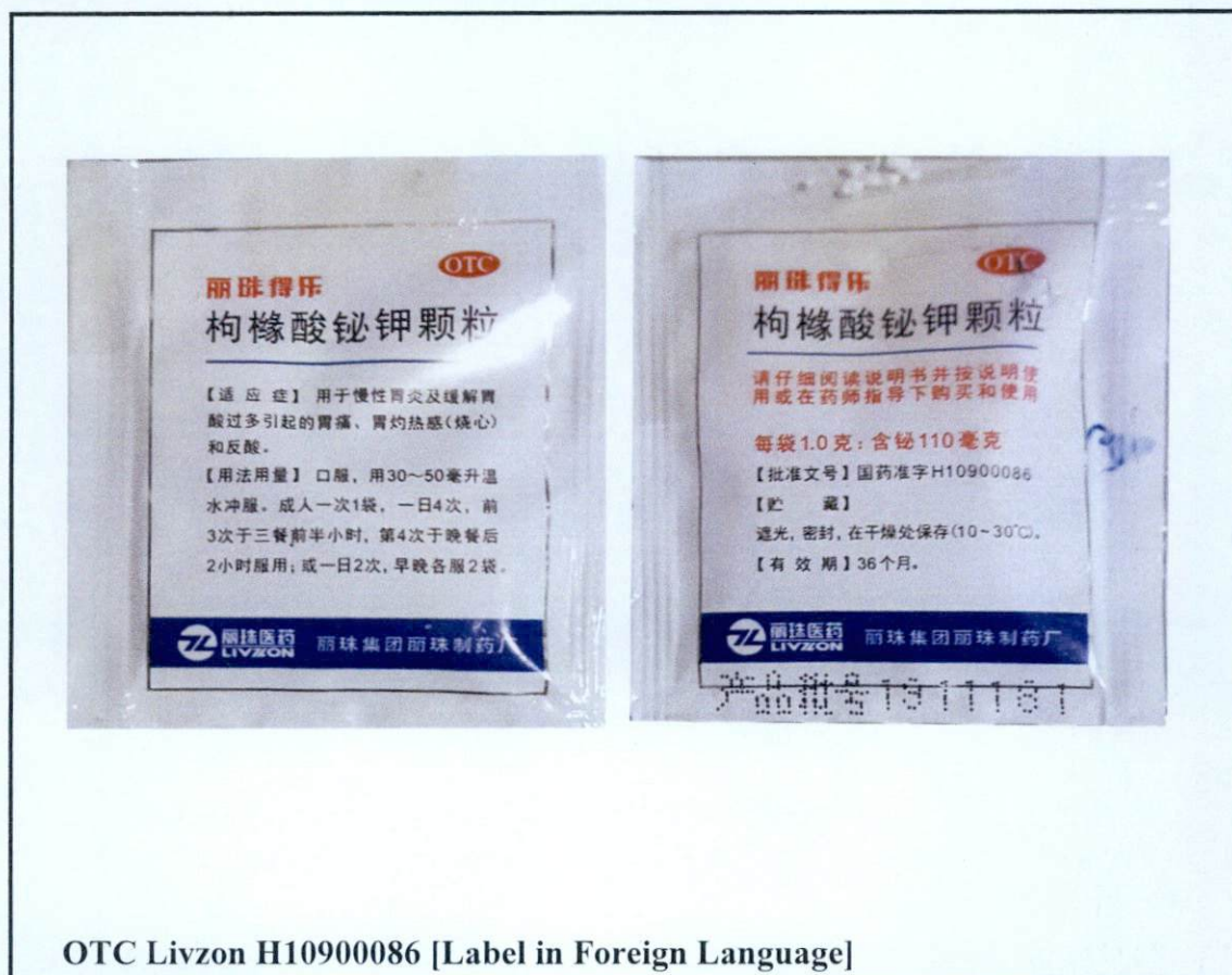
OTC Livzon H10900086 [Label in Foreign Language]

The Food and Drug Administration (FDA) advises the public against the purchase and use of the following unregistered drug products: