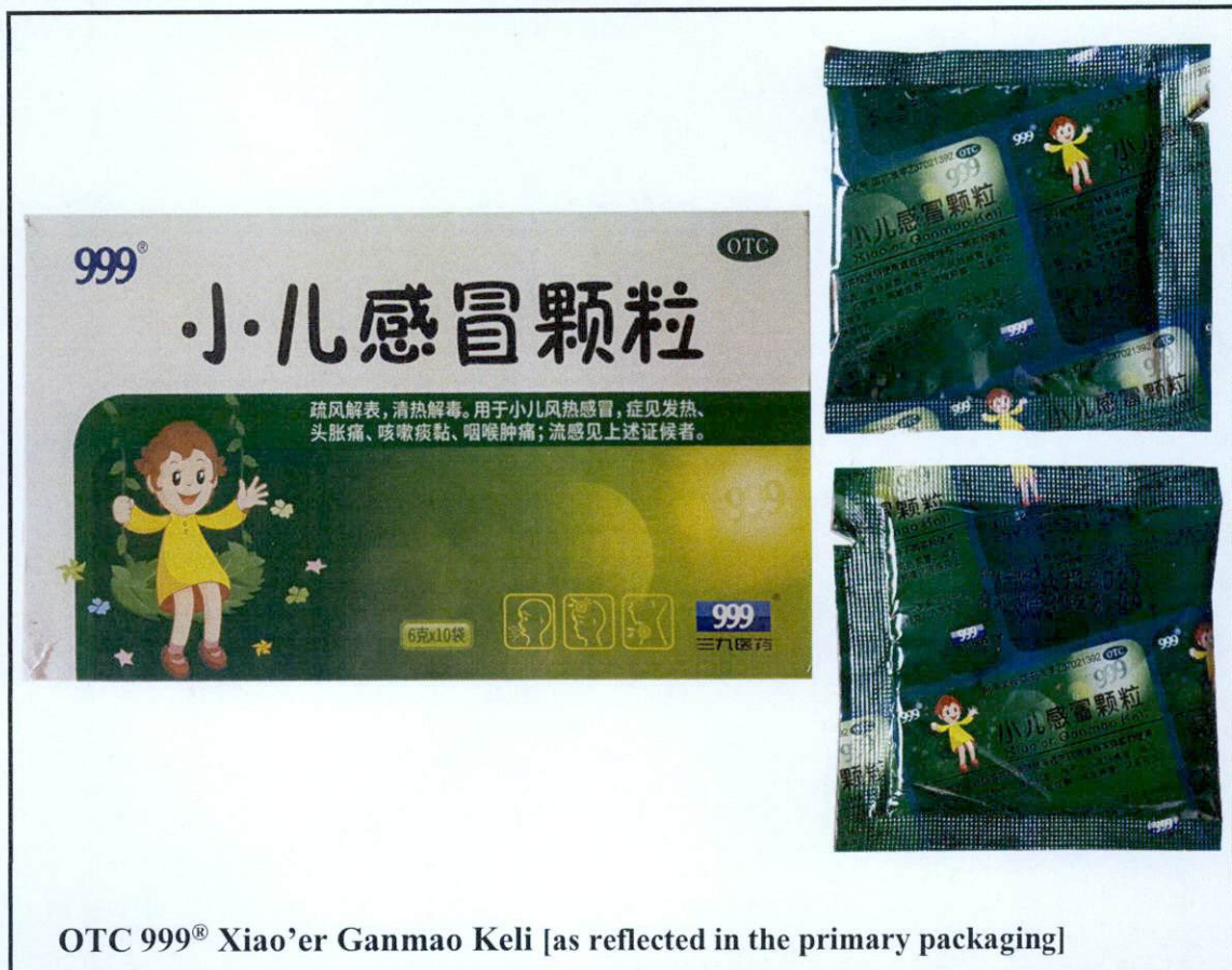
OTC 999® Xiao'er Ganmao Keli [as reflected in the primary packaging]

The Food and Drug Administration (FDA) advises the public against the purchase and use of the following unregistered drug products: