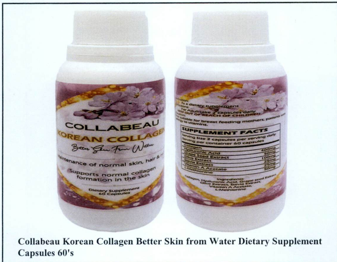
Collabeau Korean Collagen Better Skin from Water Dietary Supplement Capsules 60's

The Food and Drug Administration (FDA) advises the public against the purchase and use of the following unregistered drug products: