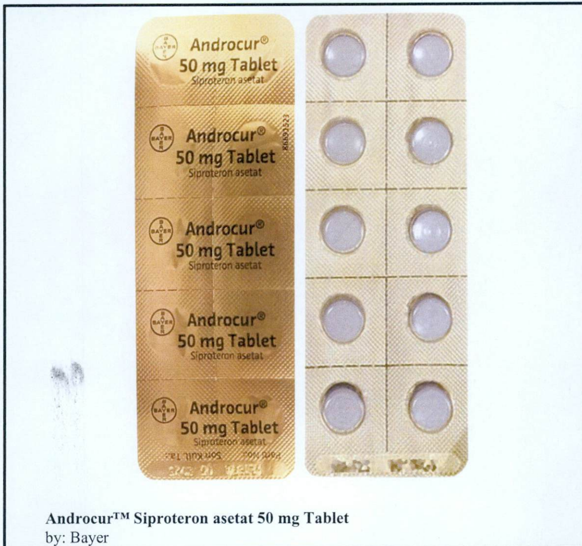
Androcur™ Siproteron asetat 50 mg Tablet by: Bayer

The Food and Drug Administration (FDA) advises the public against the purchase and use of the unregistered drug product: