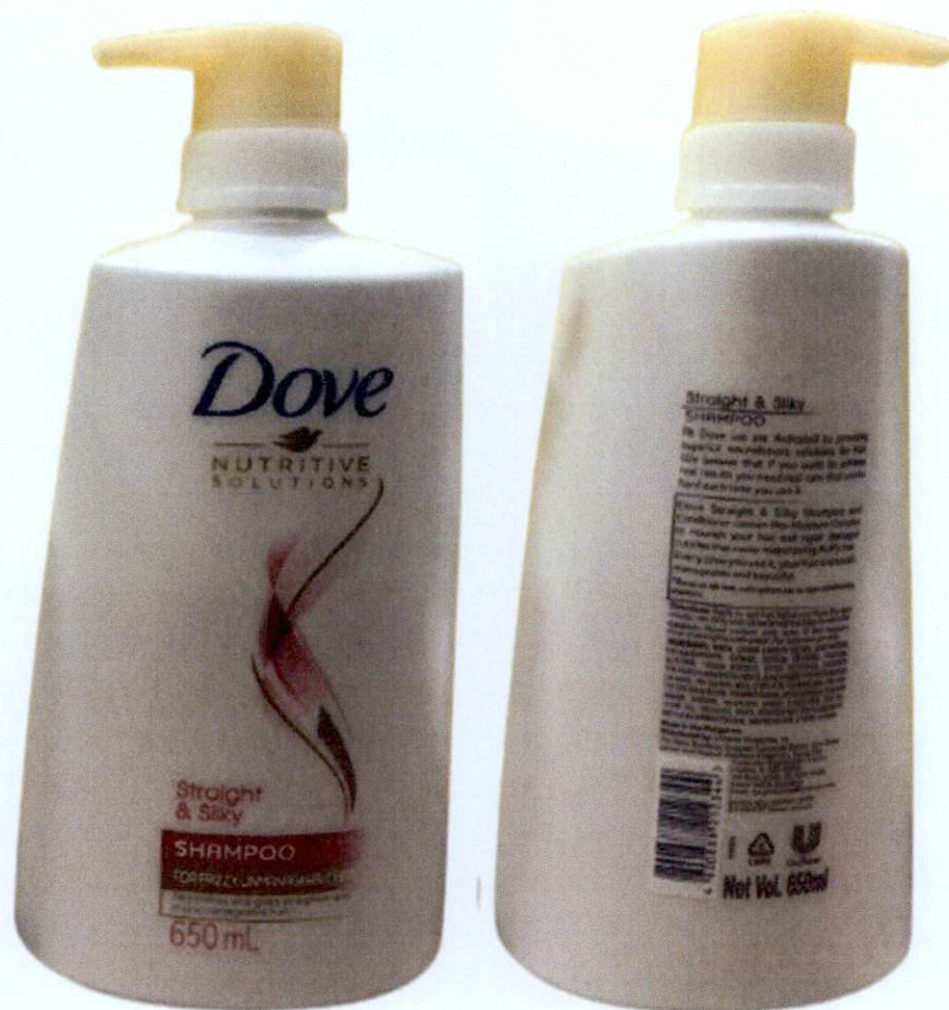
Figure 2. Authentic Dove Damage Therapy Straight & Silky Shampoo with Patented Micro Moisture Serum

The FDA has coordinated with the Market Authorization Holder (MAH), Unilever Philippines, Inc., and has verified that the aforementioned cosmetic product is COUNTERFEIT . According to the company Unilever Philippines, Inc., they are not responsible for the importation nor distribution of the aforementioned cosmetic product.