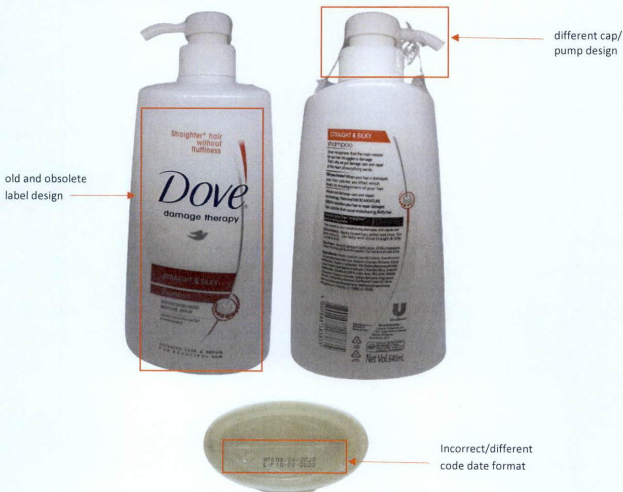
Figure 1. Counterfeit Dove Damage Therapy Straight & Silky Shampoo with Patented Micro Moisture Serum

The Food and Drug Administration (FDA) warns the public from purchasing and using the below counterfeit cosmetic product: