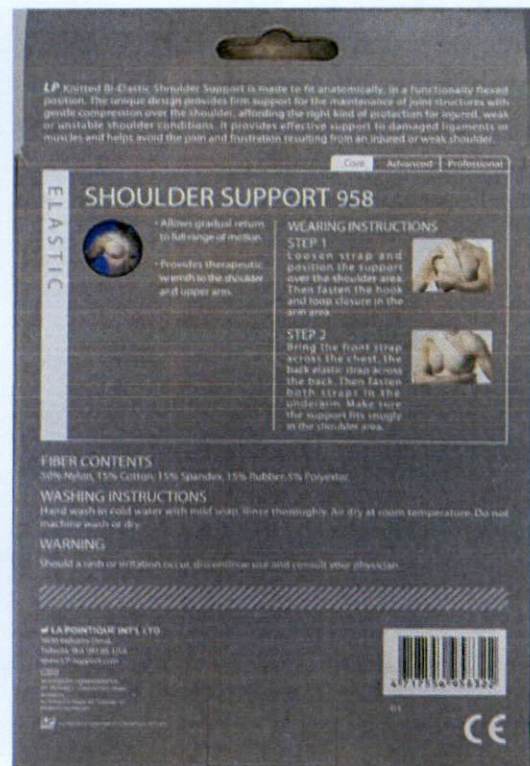
Figure 1. Unnotified LP® Support™ Shoulder Support (958 Medium)

The FDA verified through post-marketing surveillance that the above-mentioned medical device product is not notified and no corresponding Product Notification Certificate has been issued. Pursuant to the Republic Act No. 9711, otherwise known as the "Food and Drug Administration Act of 2009", the manufacture, importation, exportation, sale, offering for sale, distribution, transfer, non-consumer use, promotion, advertising or sponsorship of health products without the proper authorization is prohibited.