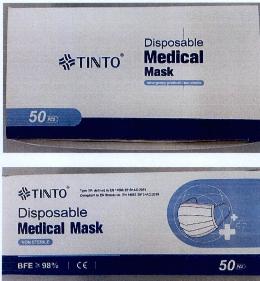
Figure 1. Unnotified Tinto® Disposable Medical Mask

The Food and Drug Administration (FDA) warns all healthcare professionals and the general public NOT TO PURCHASE AND USE the unnotified medical device product: