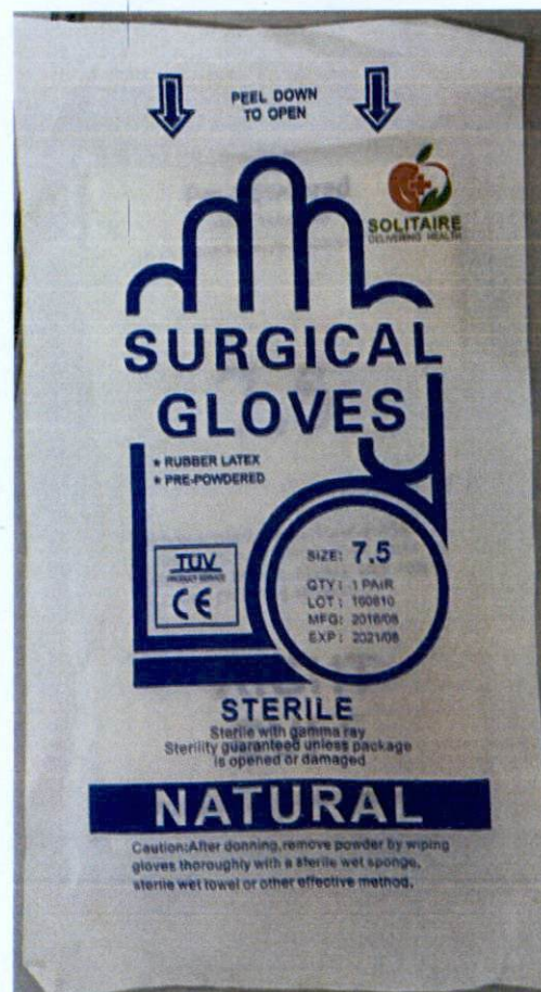
Figure 1. Banned Solitaire Surgical Gloves (Rubber Latex, Pre-Powdered size 7.5)

The Food and Drug Administration (FDA) warns all healthcare professionals and the general public NOT TO PURCHASE AND USE the banned medical device product: