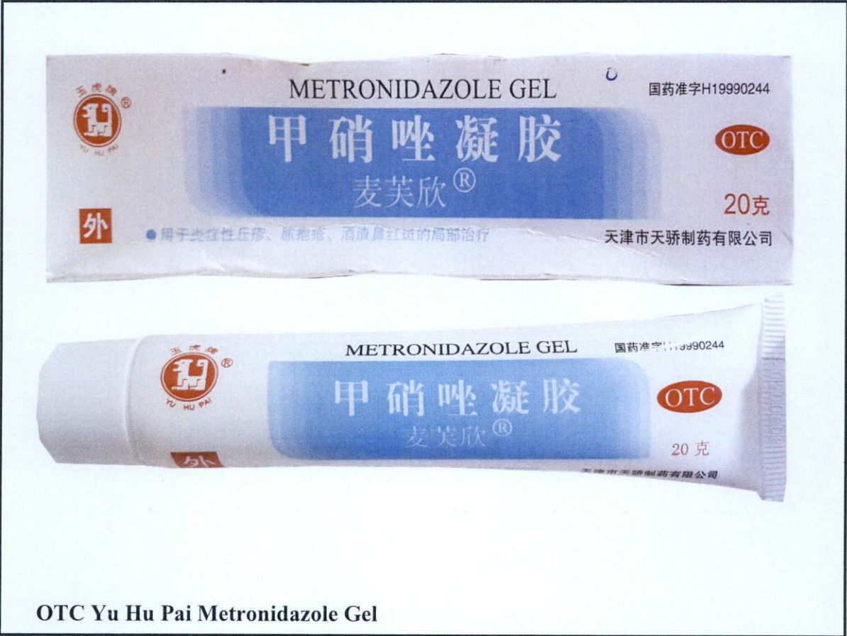
OTC Yu Hu Pai Metronidazole Gel