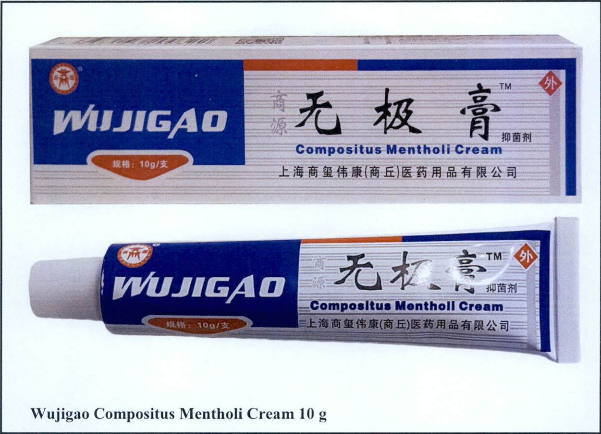
Wujigao Compositus Mentholi Cream 10 g