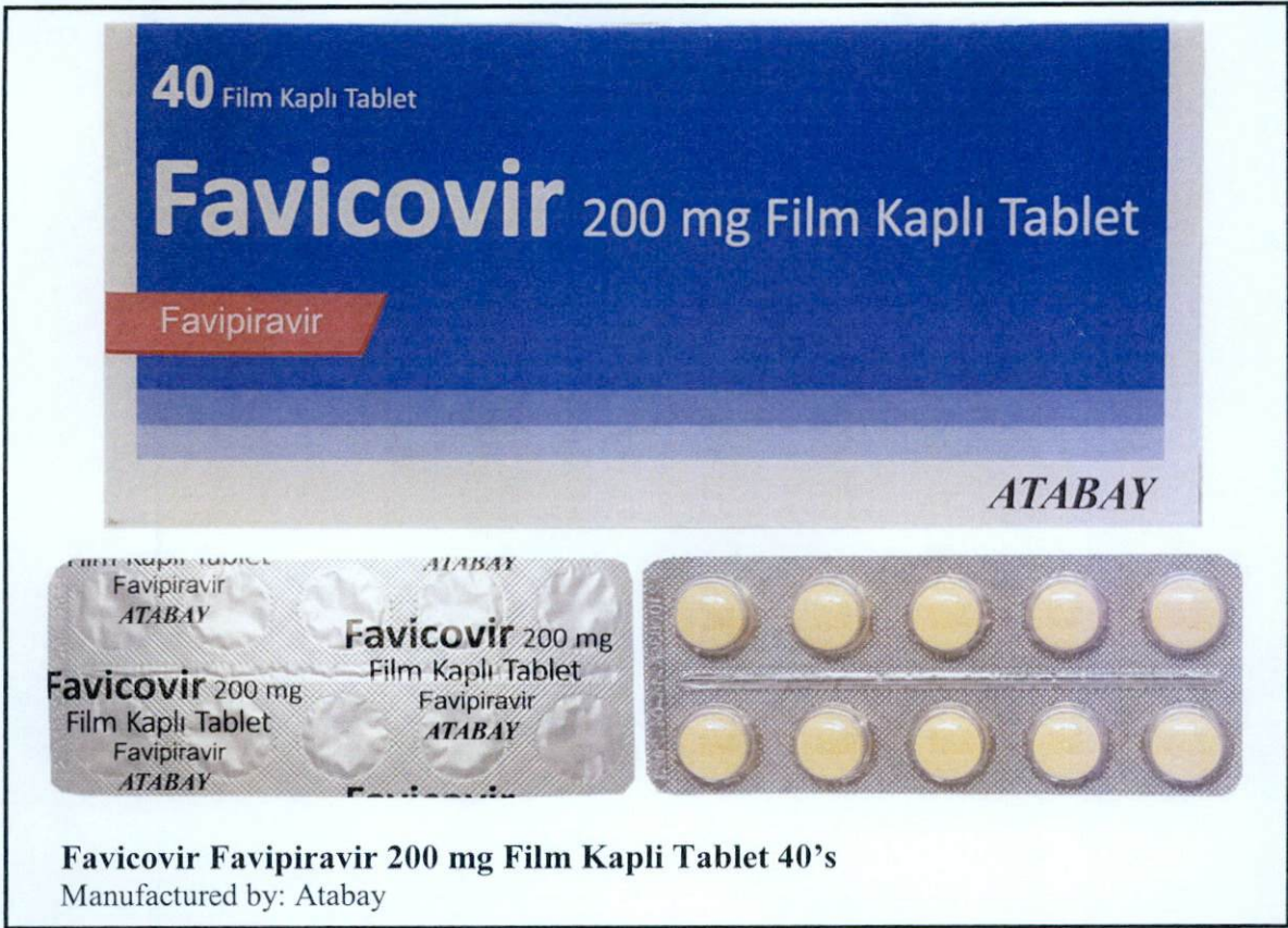
Favicovir Favipiravir 200 mg Film Kapli Tablet 40's Manufactured by: Atabay