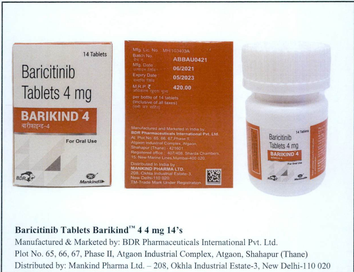
Baricitinib Tablets Barikind™ 4 4 mg 14's

Manufactured & Marketed by: BDR Pharmaceuticals International Pvt. Ltd.