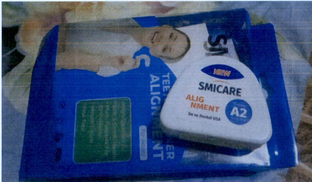
Figure 1. Unnotified Smicare Teeth Trainer Alignment

The Food and Drug Administration (FDA) warns all healthcare professionals and the general public NOT TO PURCHASE AND USE the unnotified medical device product: