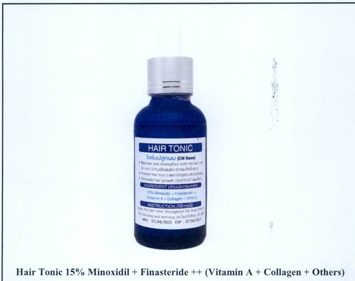
Figure 1. Unregistered drug

The Food and Drug Administration (FDA) advises the public against the purchase and use of the following unregistered drug products: