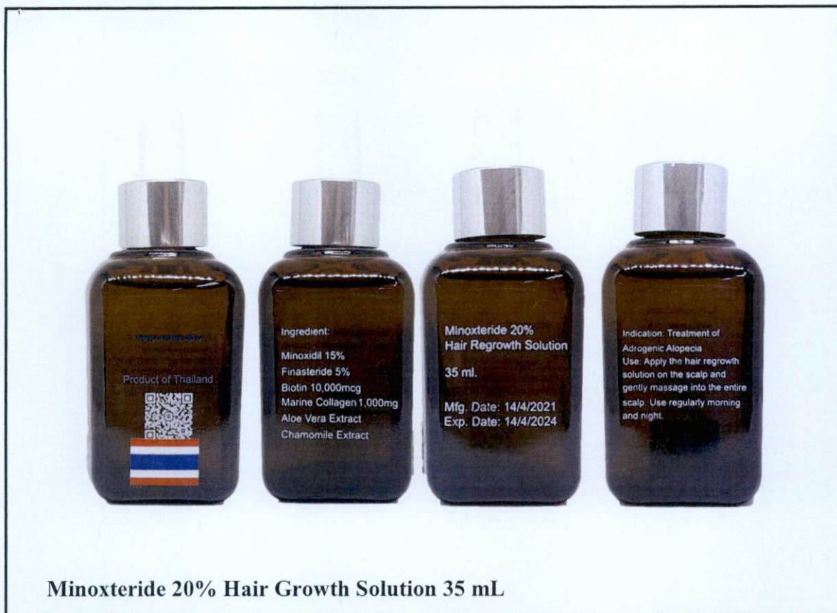
Figure 2. Unregistered drug

FDA Post-Marketing Surveillance (PMS) activities have verified that the abovementioned drug products have not gone through the registration process of the Agency and have not been issued with proper authorization in the form of Certificate of Product Registration. Thus, the Agency cannot guarantee their quality, safety and efficacy. Therefore, consumption of such violative products may pose potential danger or injury to health.