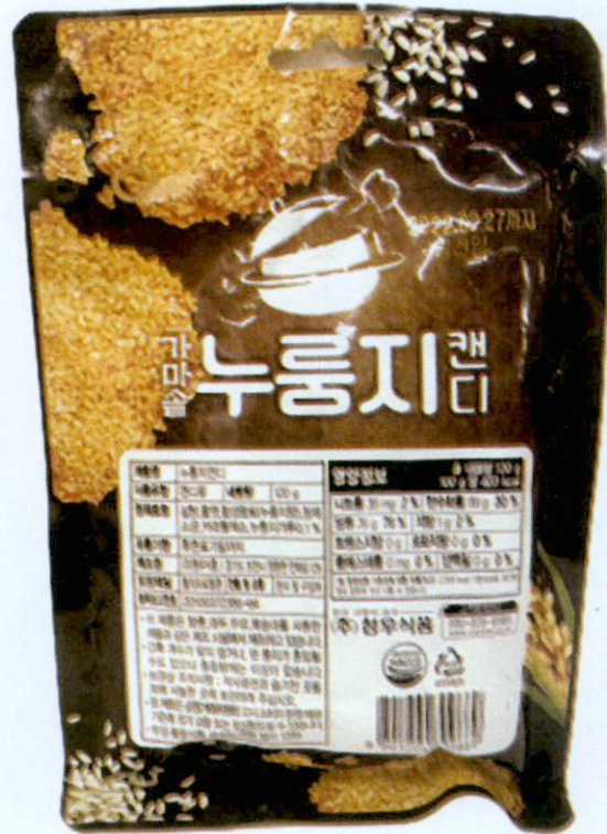
Figure 2. Unregistered CW Food Product with Rice Crispy Image in Brown Packaging (In Foreign Language)