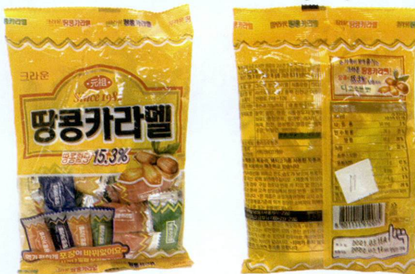
Figure 1. Unregistered Food Product with Nuts Image in Yellow Packaging (In Foreign Language)

The Food and Drug Administration (FDA) warns all healthcare professionals and the general public NOT TO PURCHASE AND CONSUME the following unregistered food products: