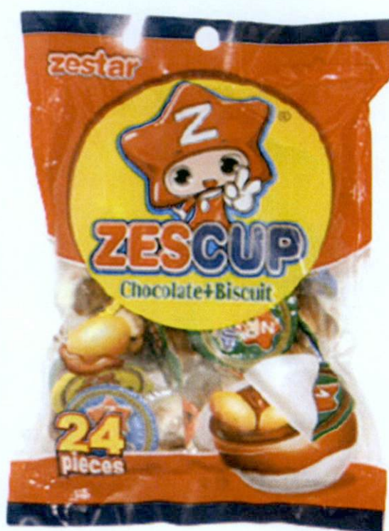
Figure 5. Unregistered ZESTAR Zescup Chocolate + Biscuit