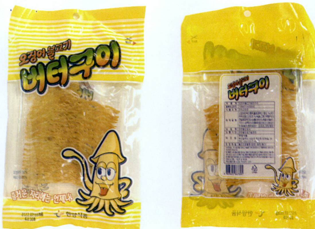
Figure 4. Unregistered Food Product with Squid Character in Yellow Packaging (In Foreign Language)