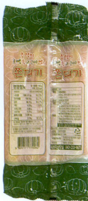
Figure 3. Unregistered Orange and Yellow Candy-Like Product in Transparent and Green Packaging (In Foreign Language)