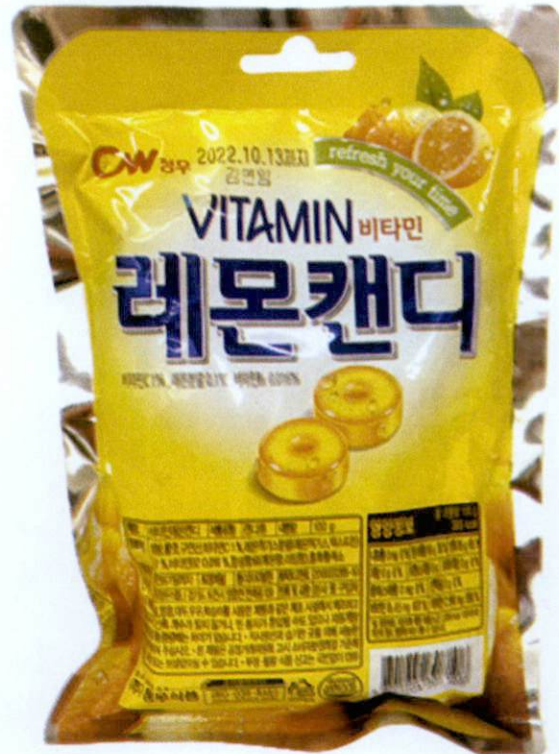
Figure 3. Unregistered CW Vitamin with Orange Image in Yellow Packaging (In Foreign Language)