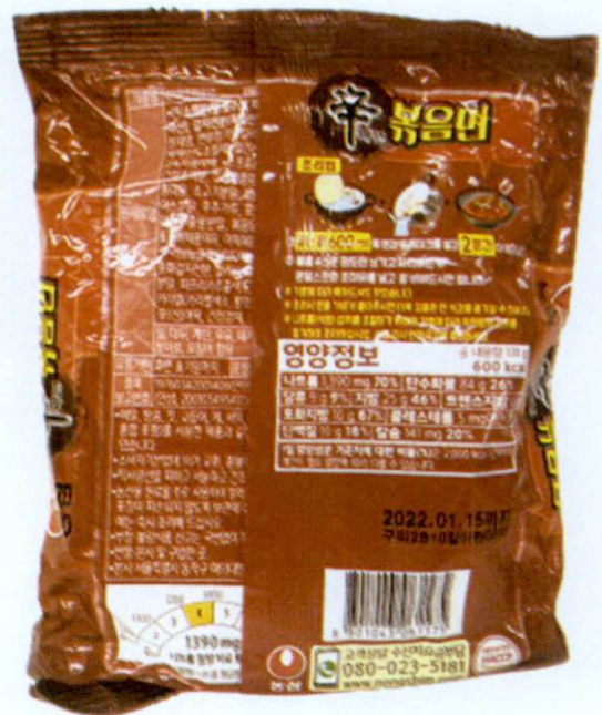
Figure 4. Unregistered Instant Noodle with Meat Image in Red Packaging (In Foreign Language)