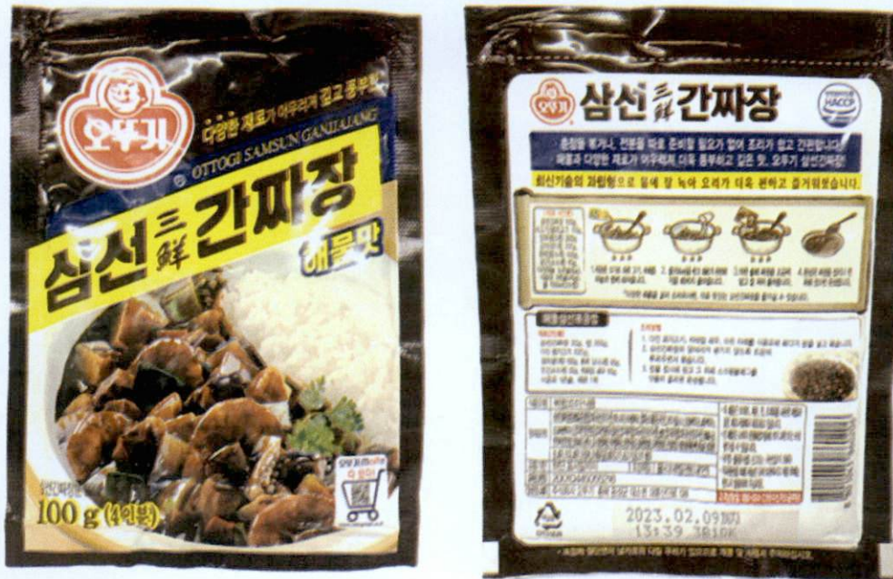
Figure 1. Unregistered OTTOGI Samsun Ganjjajang (In Foreign Language)

The Food and Drug Administration (FDA) warns all healthcare professionals and the general public NOT TO PURCHASE AND CONSUME the following unregistered food products: