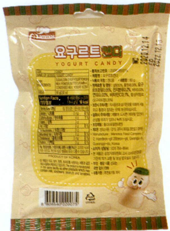
Figure 2. Unregistered MAMMOS Yogurt Candy in Peach Packaging (In Foreign Language)