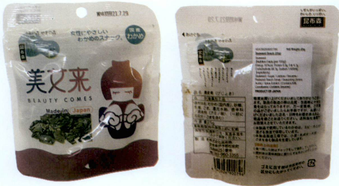
Figure 2. Unregistered Seaweed Snack in White Stand-Up Pouch (In Foreign Language)