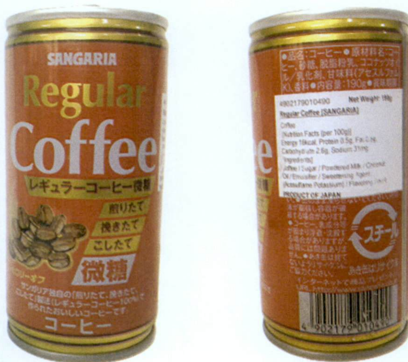
Figure 3. Unregistered SANGARIA Regular Coffee (In Foreign Language)