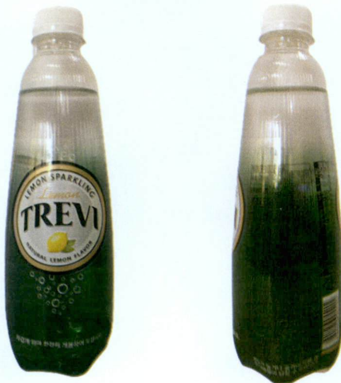
Figure 5. Unregistered TREVI Lemon Sparkling Natural Lemon Flavor (In Foreign Language)