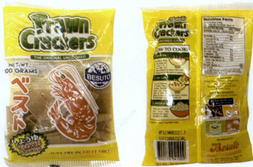
Figure 1. Unregistered BESUTO Prawn Crackers Flavored Chips Shoyu Flavor

The Food and Drug Administration (FDA) warns all healthcare professionals and the general public NOT TO PURCHASE AND CONSUME the following unregistered food products: