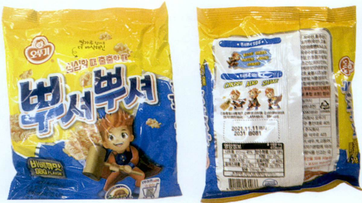
Figure 4. Unregistered BBQ Flavor Instant Noodle in Yellow and Blue Packaging (In Foreign Language)