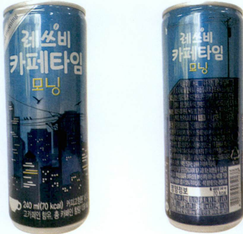
Figure 2. Unregistered GOOD MORNING Beverage with Buildings Image in Turquoise Aluminum Can (In Foreign Language)