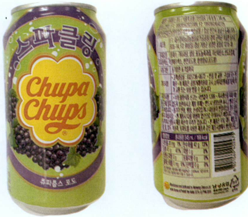
Figure 2. Unregistered CHUPA CHUPS Beverage with Grapes Image in Green and Violet Aluminum Can (In Foreign Language)