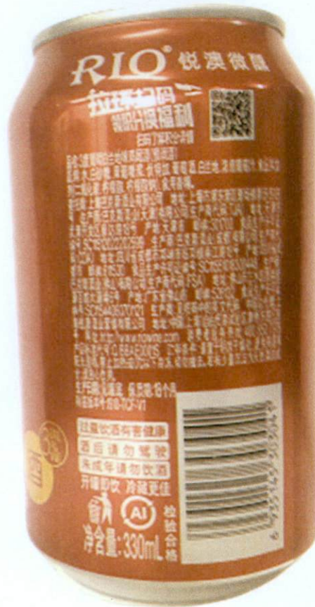
Figure 3. Unregistered RIO Light Grape + Brandy Flavour in Red Aluminum Can (In Foreign Language)