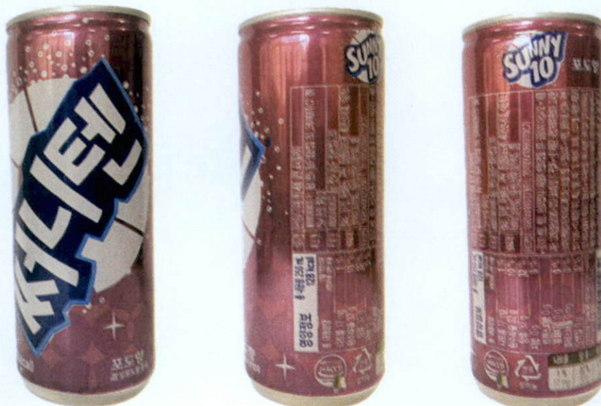
Figure 1. Unregistered SUNNY10 Beverage in Violet Aluminum Can (In Foreign Language)

The Food and Drug Administration (FDA) warns all healthcare professionals and the general public NOT TO PURCHASE AND CONSUME the following unregistered food products: