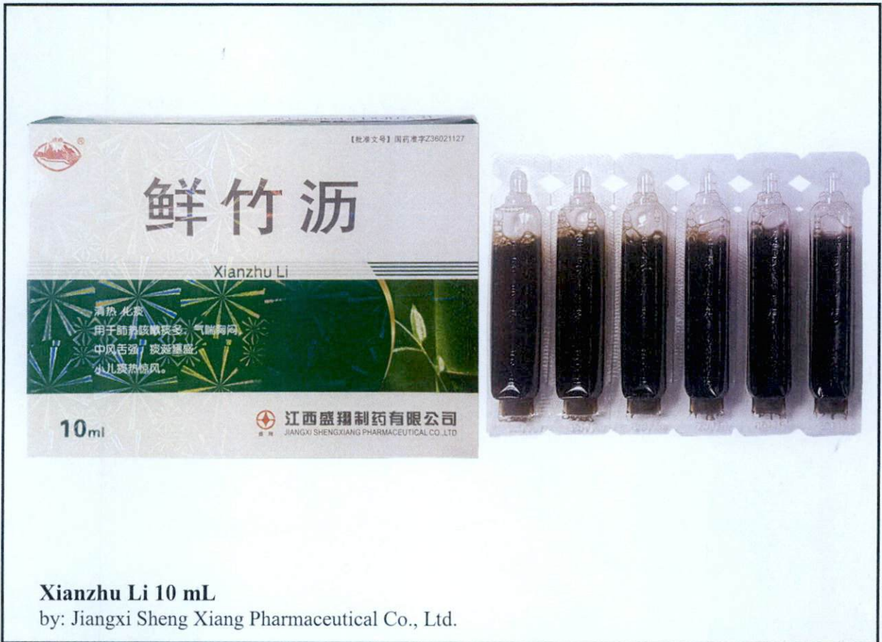
Figure 2. Unregistered drug

by: Wuhan Jiulong Humanwell Pharmaceutical Co., Ltd.