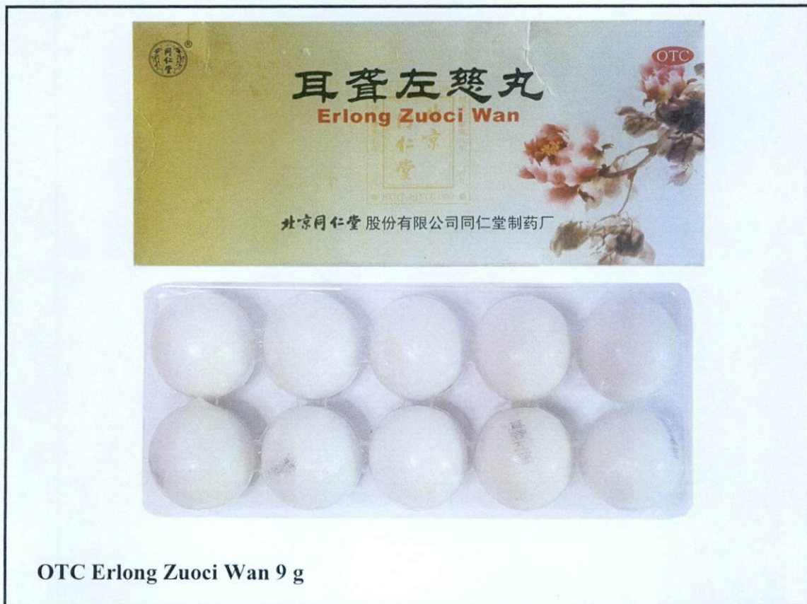
OTC Erlong Zuoci Wan 9 g

The Food and Drug Administration (FDA) advises the public against the purchase and use of the following unregistered drug products: