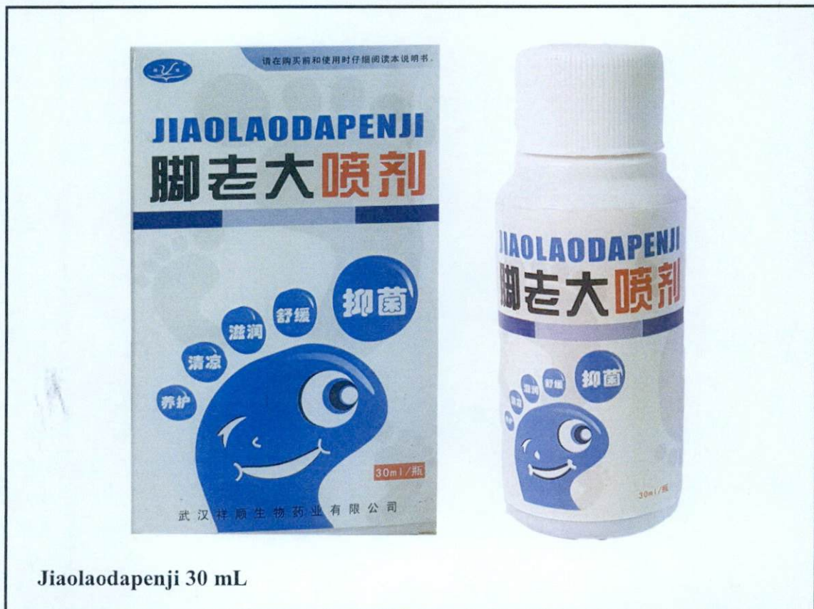
Jiaolaodapenji 30 mL

The Food and Drug Administration (FDA) advises the public against the purchase and use of the following unregistered drug products: