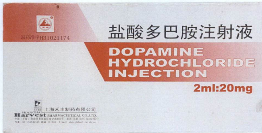
Figure 2. Unregistered drug