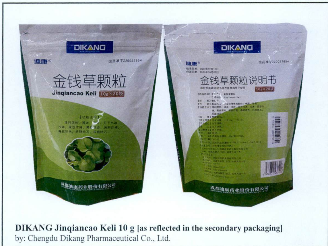
Figure 1. Unregistered drug

The Food and Drug Administration (FDA) advises the public against the purchase and use of the following unregistered drug products: