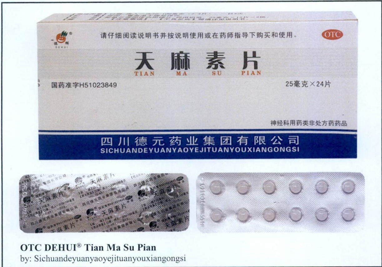
Figure 2. Unregistered drug