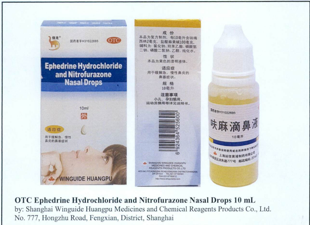
Figure 3. Unregistered drug