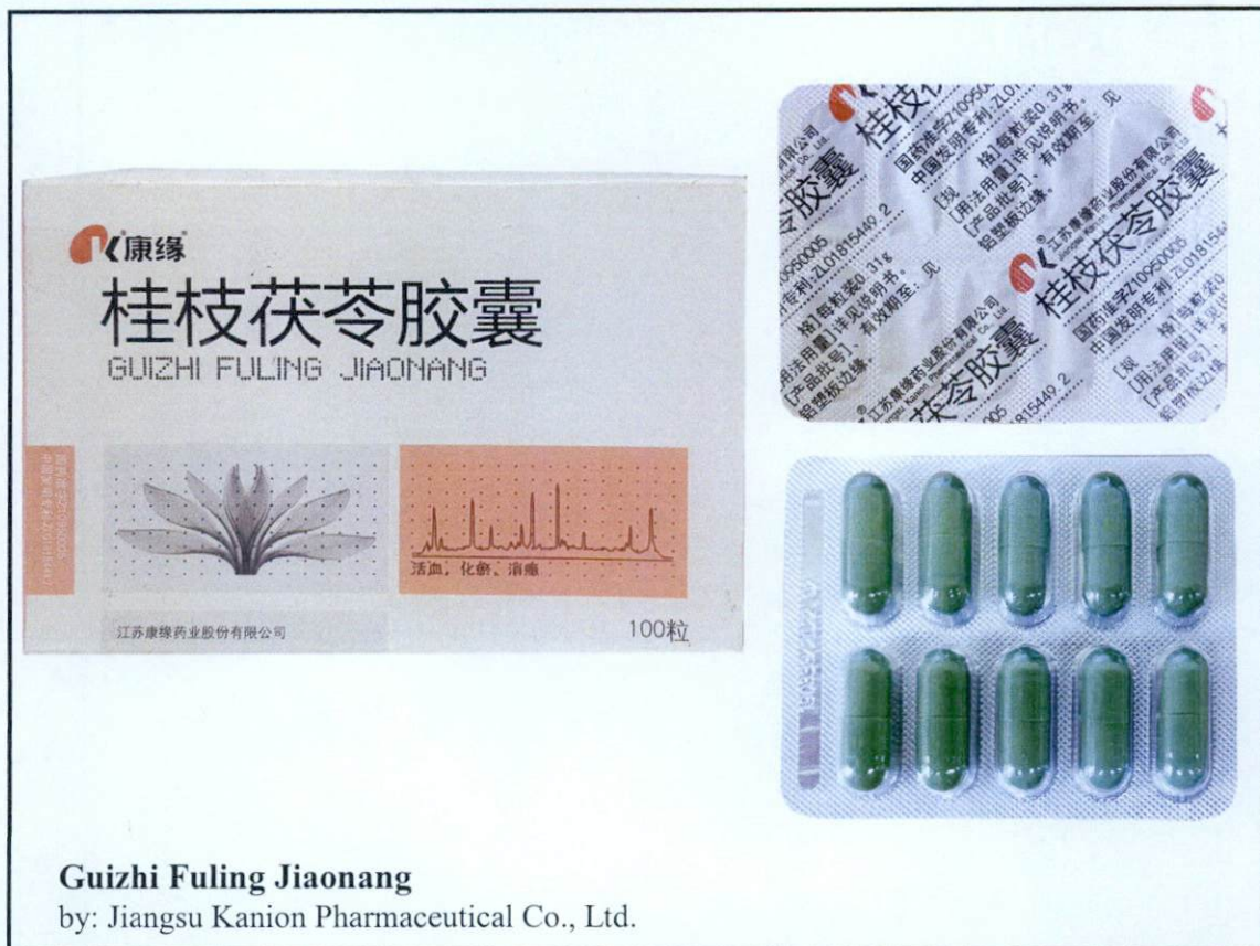
Figure 1. Unregistered drug

The Food and Drug Administration (FDA) advises the public against the purchase and use of the following unregistered drug products: