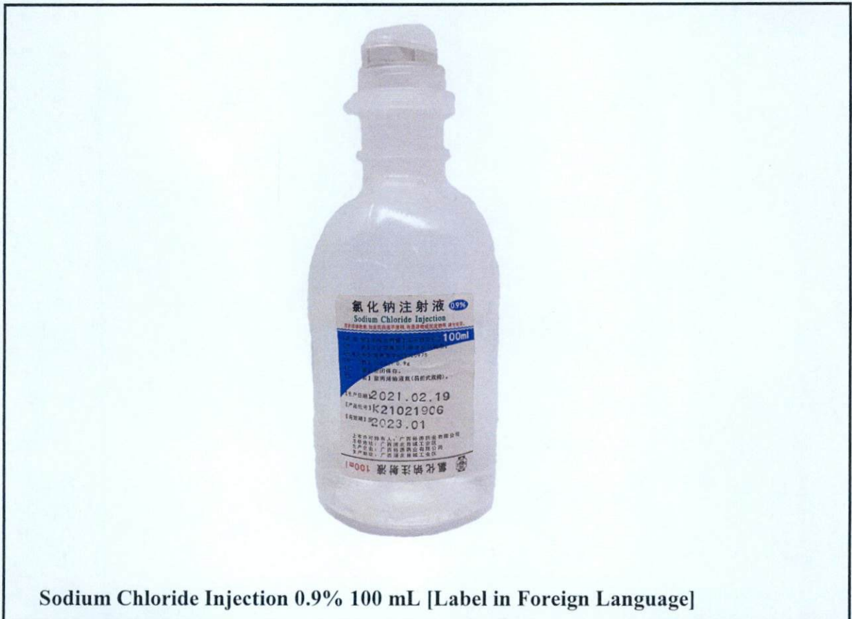
Sodium Chloride Injection 0.9% 100 mL [Label in Foreign Language]