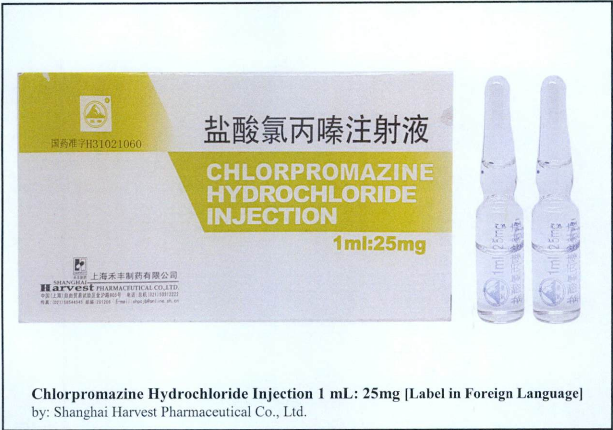
Chlorpromazine Hydrochloride Injection 1 mL: 25mg [Label in Foreign Language] by: Shanghai Harvest Pharmaceutical Co., Ltd.