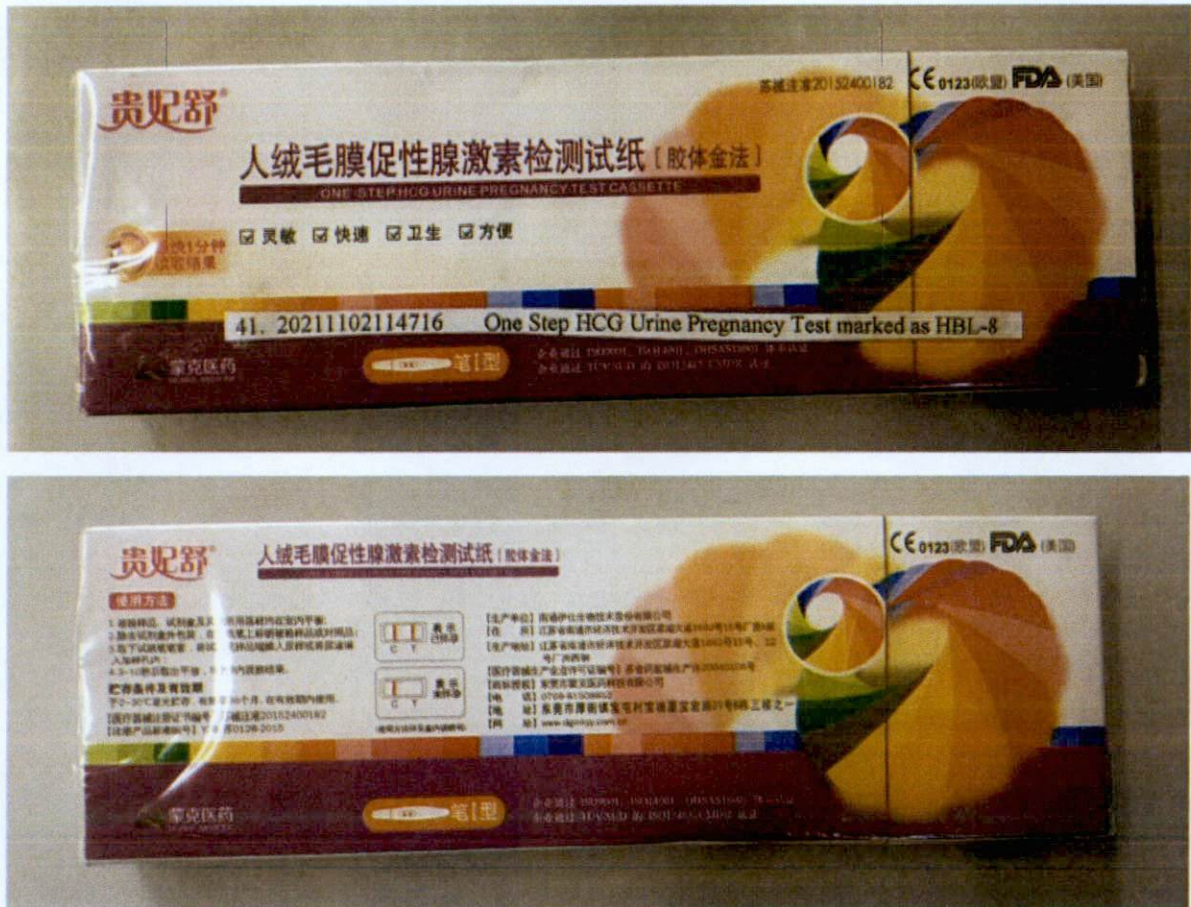
Figure 1. Unregistered One Step HCG Urine Pregnancy Test Cassette (In Foreign Characters)

The Food and Drug Administration (FDA) warns all healthcare professionals and the general public NOT TO PURCHASE AND USE the unregistered medical device product: