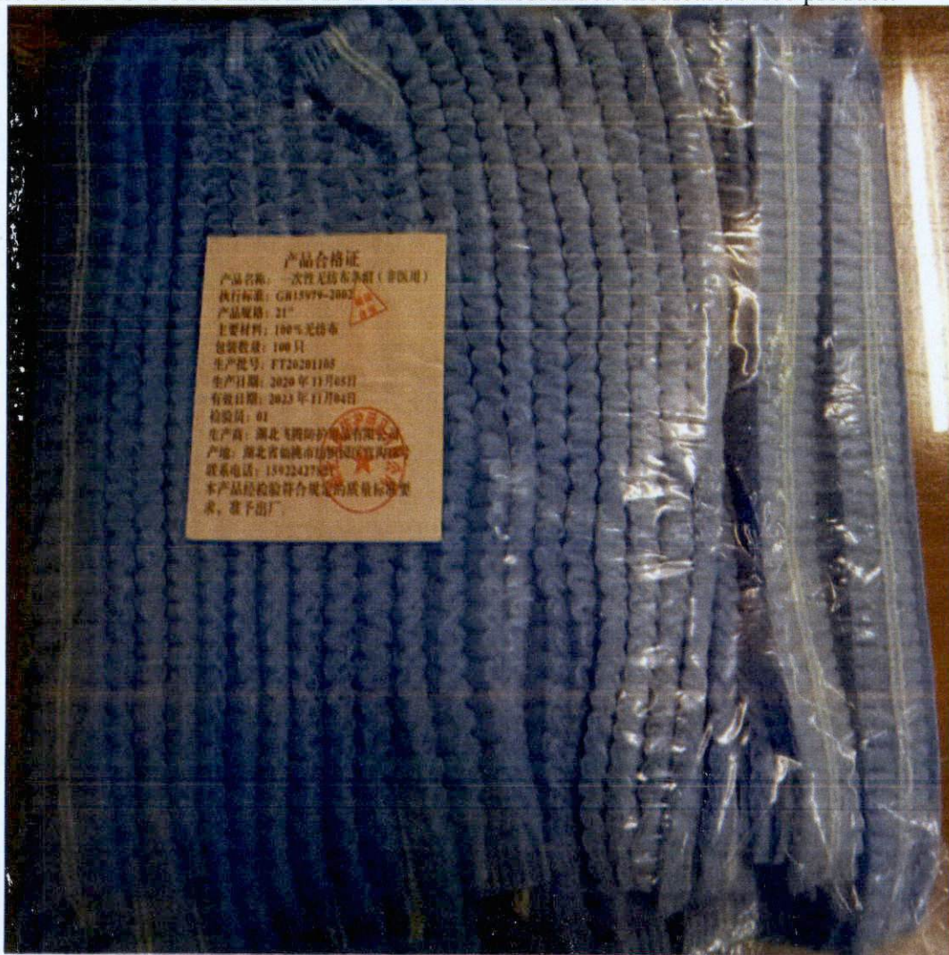
Figure 1. Misbranded Bouffant Cap (claimed as Surgitech) in Foreign Characters

The Food and Drug Administration (FDA) warns all healthcare professionals and the general public NOT TO PURCHASE AND USE the misbranded medical device product: