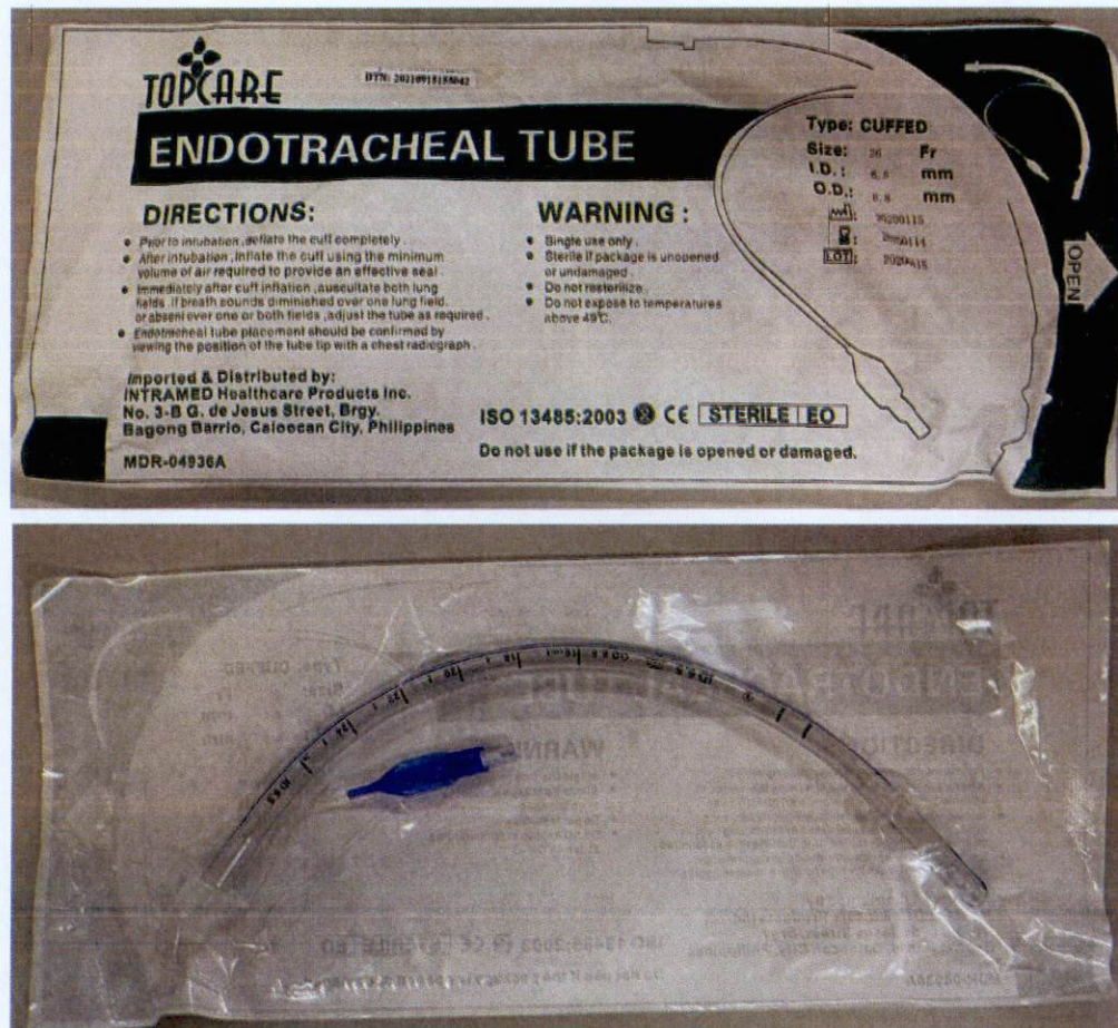
Figure 1. TOPCARE Endotracheal Tube Cuffed with Expired Certificate of Product Registration

The Food and Drug Administration (FDA) warns all healthcare professionals and the general public NOT TO PURCHASE AND USE the medical device product with expired Certificate of Product Registration: