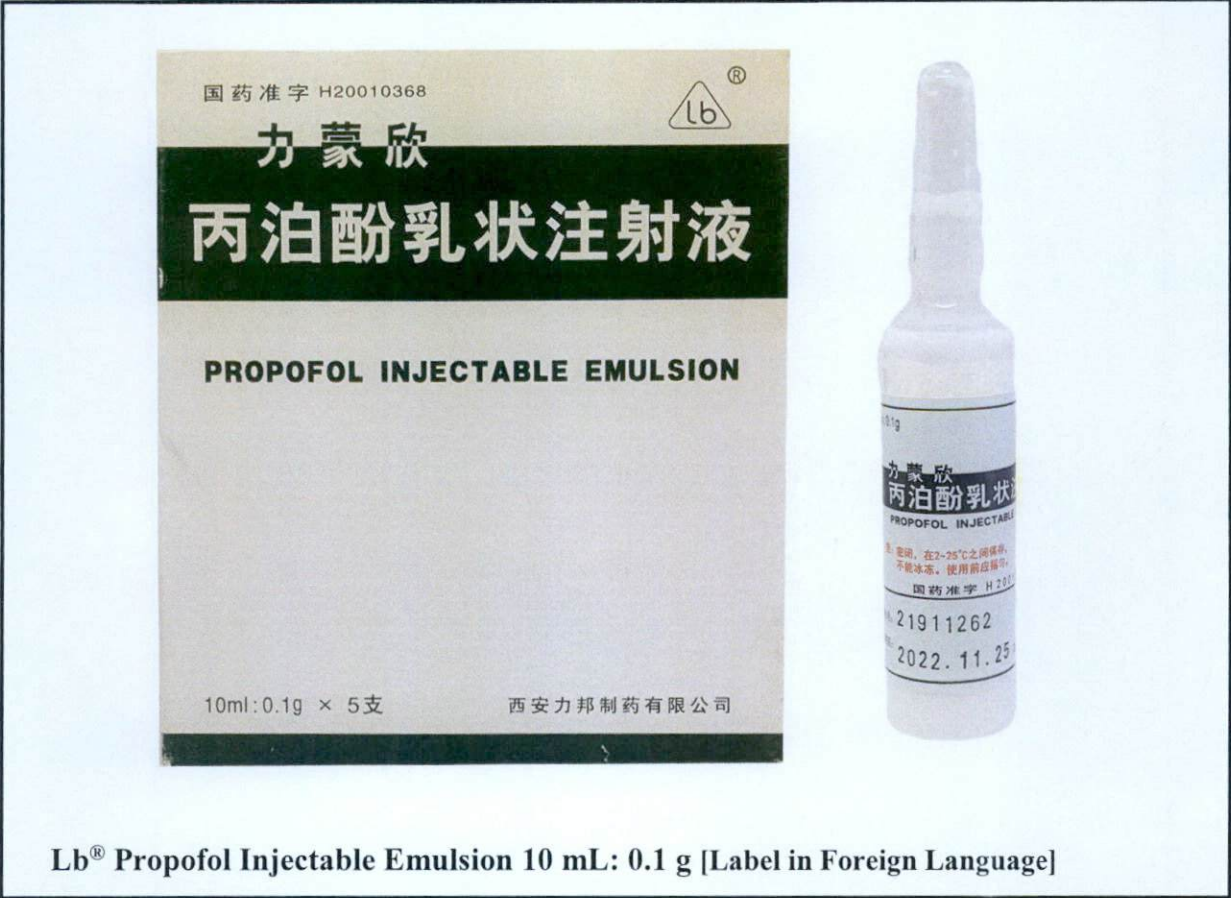
Figure 3. Unregistered drug