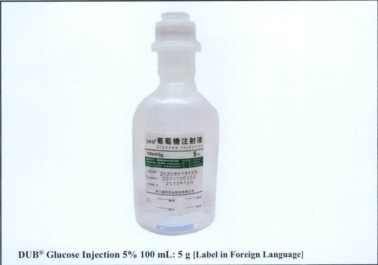
Figure 2. Unregistered drug