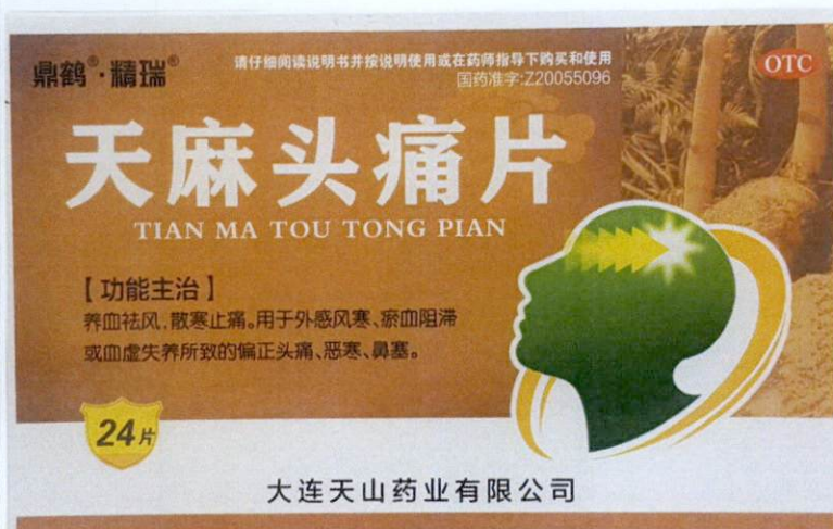
Figure 2. Unregistered drug