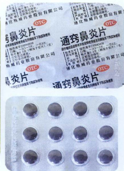
OTC Tongqiao Biyan Pian