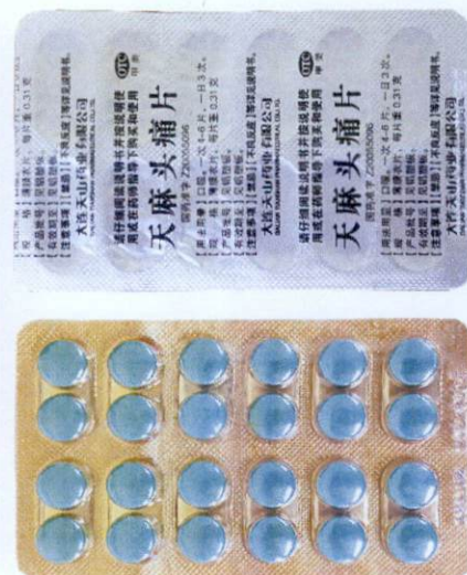
OTC Tian Ma Tou Tong Pian