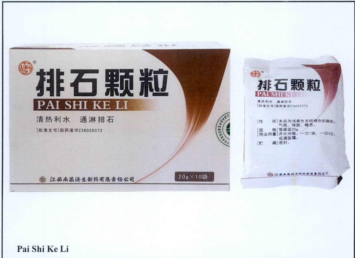
Figure 3. Unregistered drug