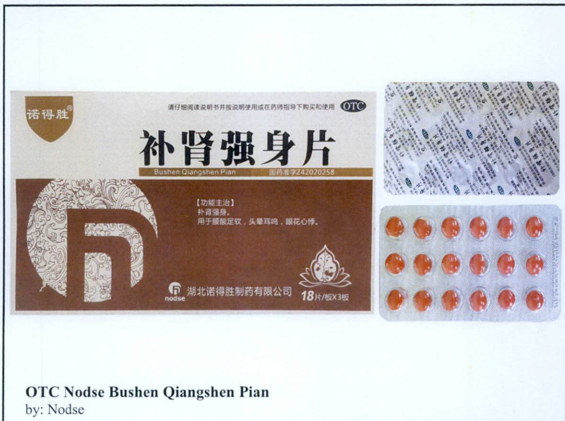
OTC Nodse Bushen Qiangshen Pian by: Nodse

The Food and Drug Administration (FDA) advises the public against the purchase and use of the following unregistered drug products: