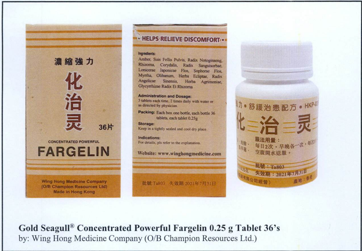
Figure 2. Unregistered drug