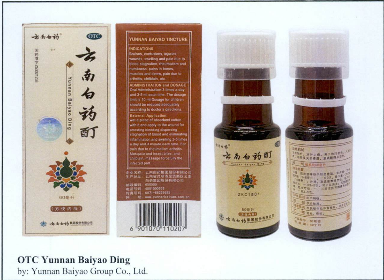
Figure 3. Unregistered drug