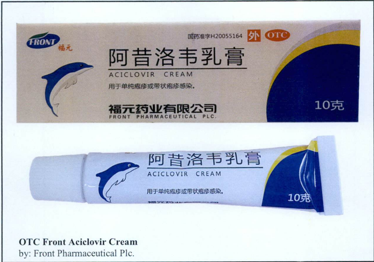
Figure 2. Unregistered drug