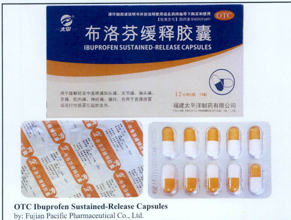
Figure 1. Unregistered drug

The Food and Drug Administration (FDA) advises the public against the purchase and use of the following unregistered drug products: