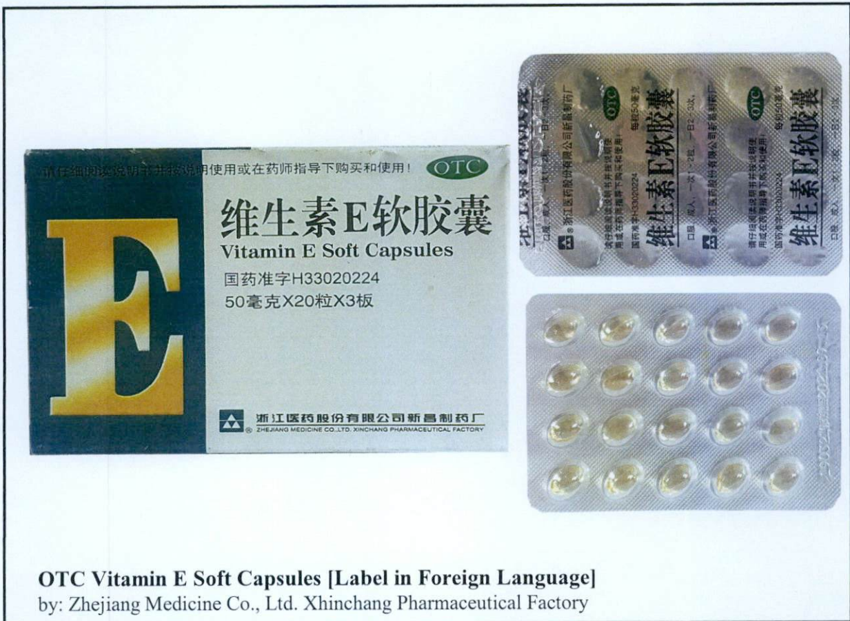
OTC Vitamin E Soft Capsules [Label in Foreign Language] by: Zhejiang Medicine Co., Ltd. Xinchang Pharmaceutical Factory