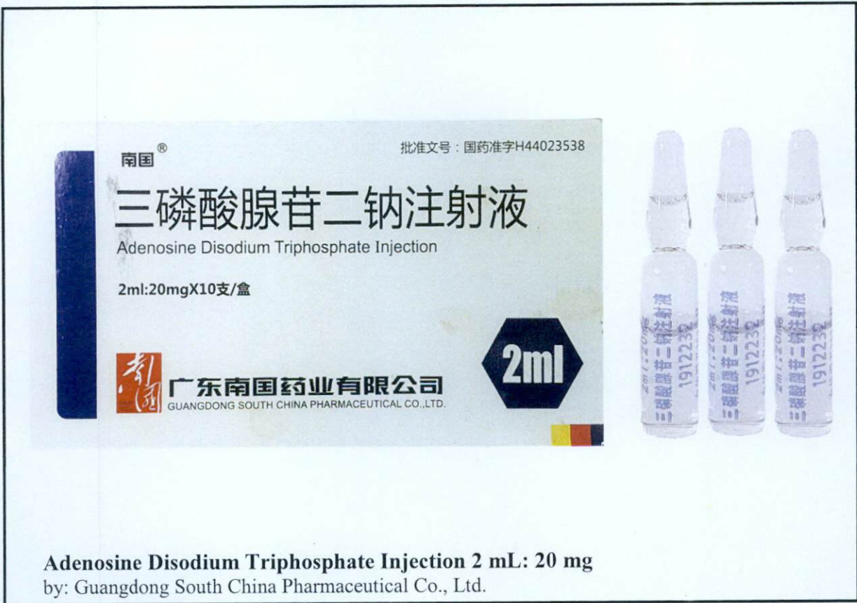
Adenosine Disodium Triphosphate Injection 2 mL: 20 mg by: Guangdong South China Pharmaceutical Co., Ltd.