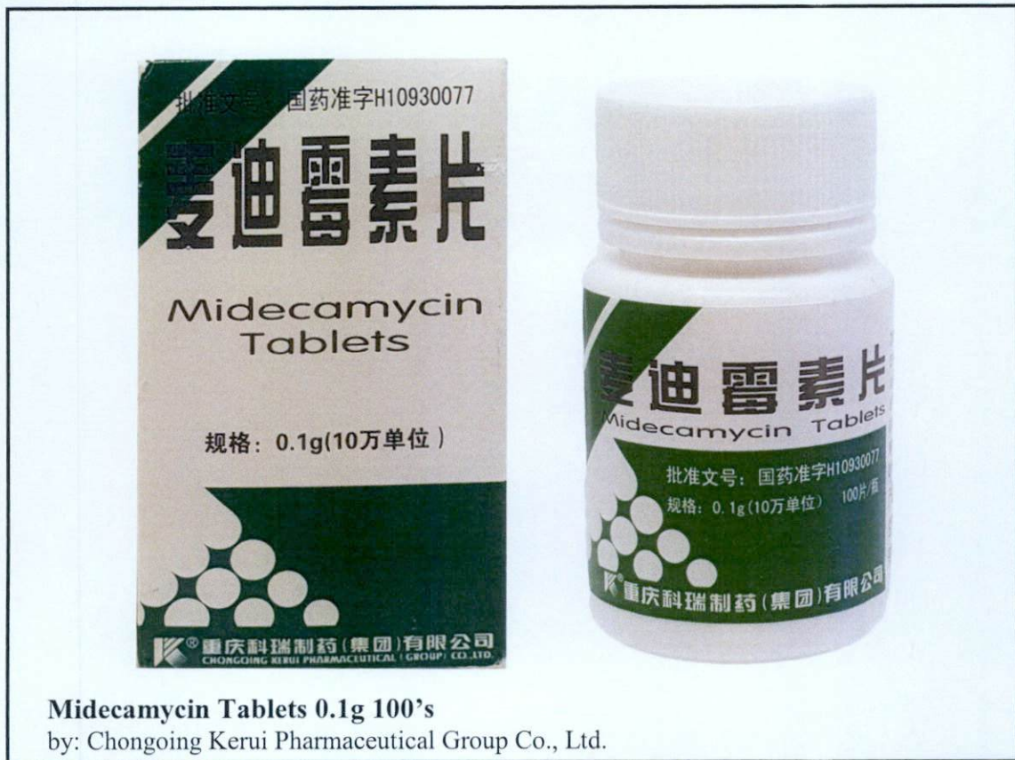
Midecamycin Tablets 0.1g 100's by: Chongqing Kerui Pharmaceutical Group Co., Ltd.

The Food and Drug Administration (FDA) advises the public against the purchase and use of the following unregistered drug products: