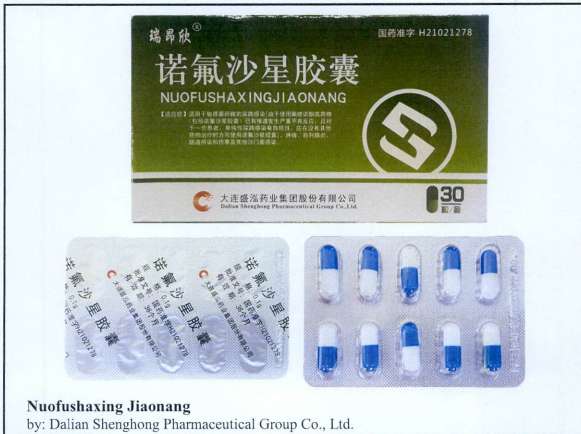
Figure 1. Unregistered drug

The Food and Drug Administration (FDA) advises the public against the purchase and use of the following unregistered drug products: