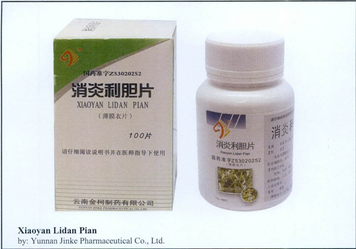
Xiaoyan Lidan Pian by: Yunnan Jinke Pharmaceutical Co., Ltd.