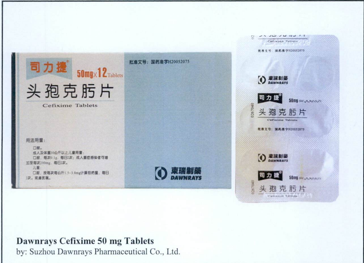
Dawnrays Cefixime 50 mg Tablets by: Suzhou Dawnrays Pharmaceutical Co., Ltd.