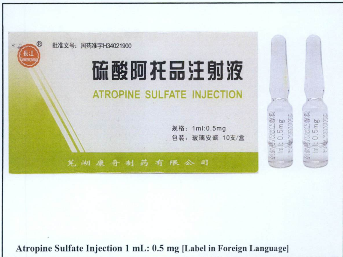
Atropine Sulfate Injection 1 mL: 0.5 mg [Label in Foreign Language]

The Food and Drug Administration (FDA) advises the public against the purchase and use of the following unregistered drug products: