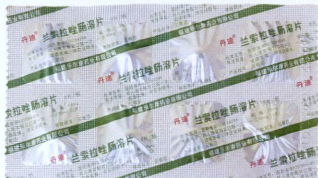
Lansoprazole Enteric-Coated Tablets 15 mg [Label in Foreign Language] by: Fujian Le Er Kang Medicine Co., Ltd.