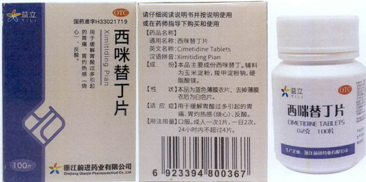
OTC Yili Cimetidine Tablets -Ximitiding Pian by: Zhejiang Qianjin Pharmaceutical Co., Ltd.