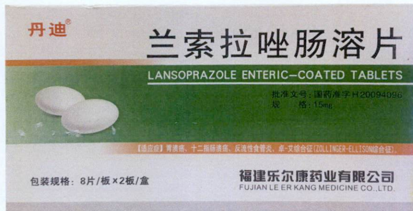
Figure 2. Unregistered drug