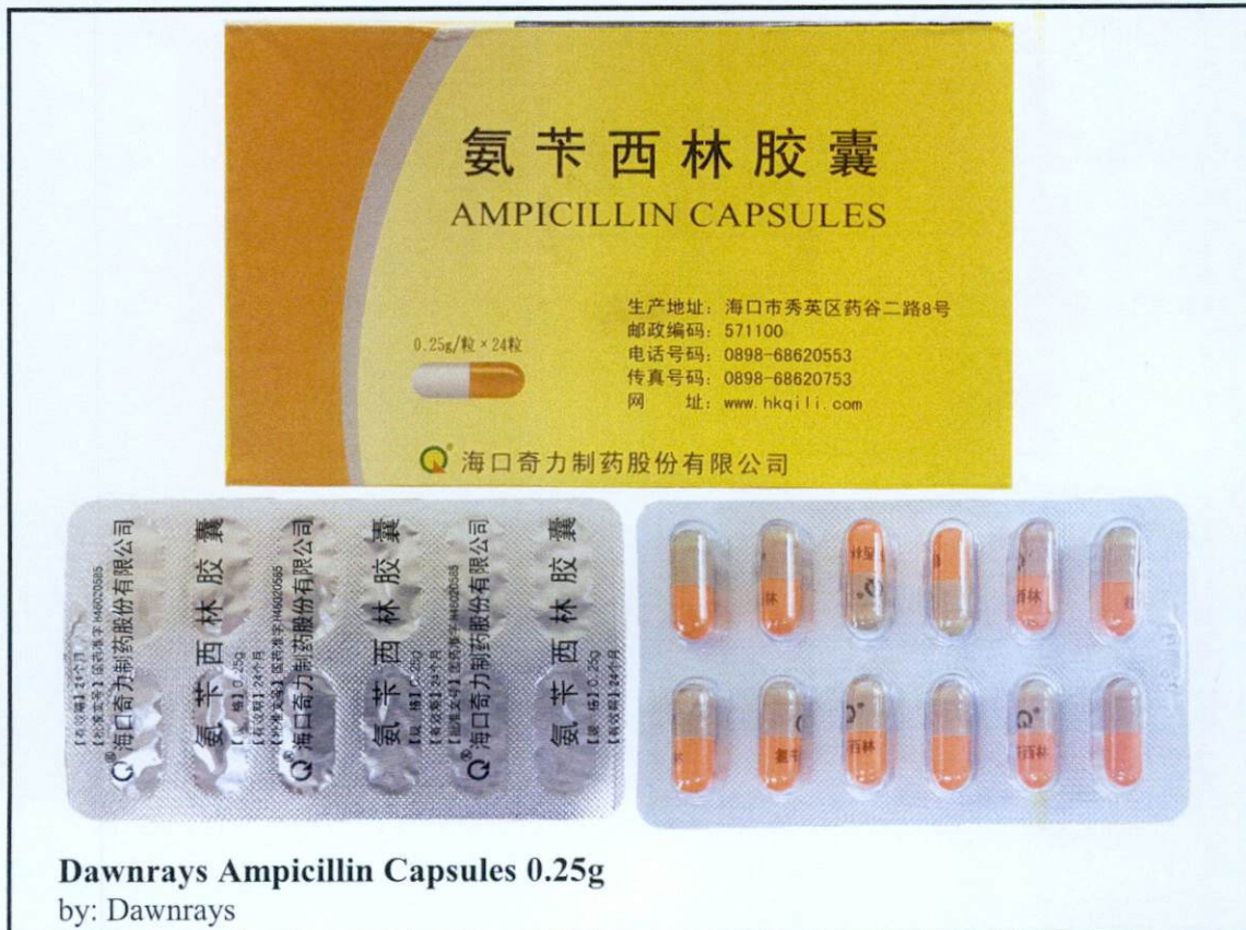
Figure 1. Unregistered drug

The Food and Drug Administration (FDA) advises the public against the purchase and use of the following unregistered drug products: