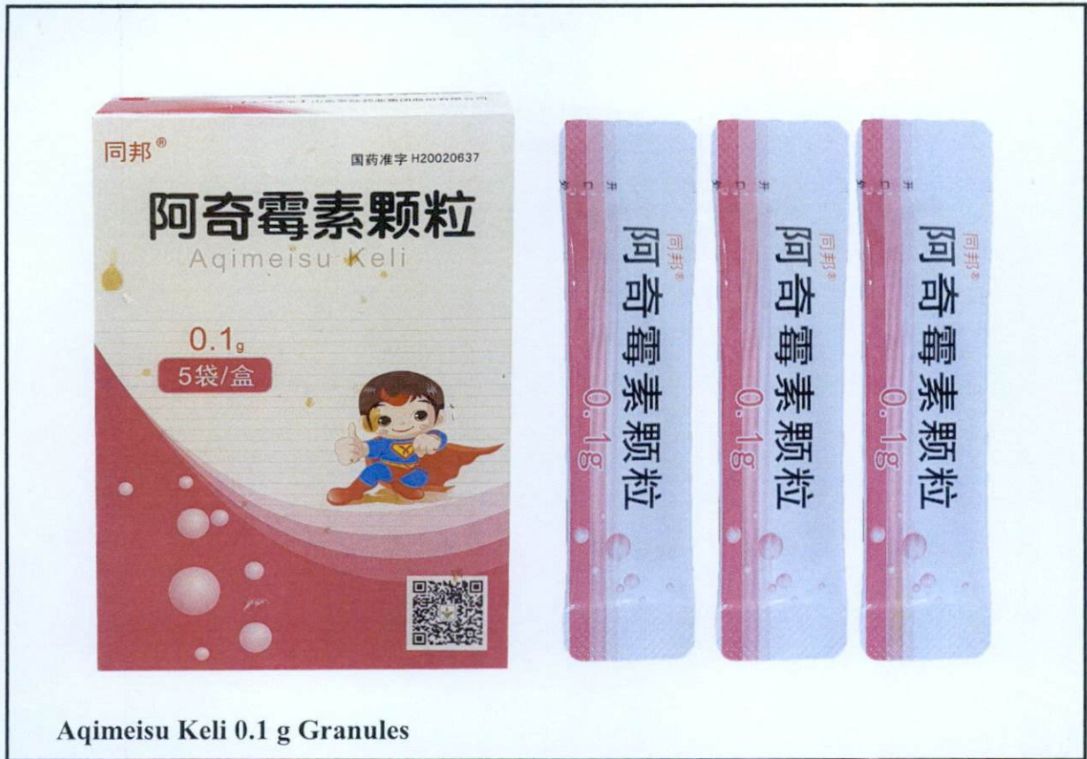
Aqimeisu Keli 0.1 g Granules