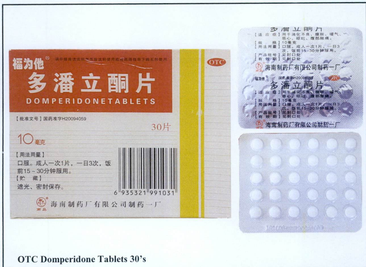
Figure 3. Unregistered drug