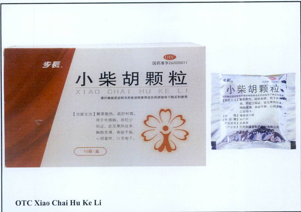
Figure 2. Unregistered drug