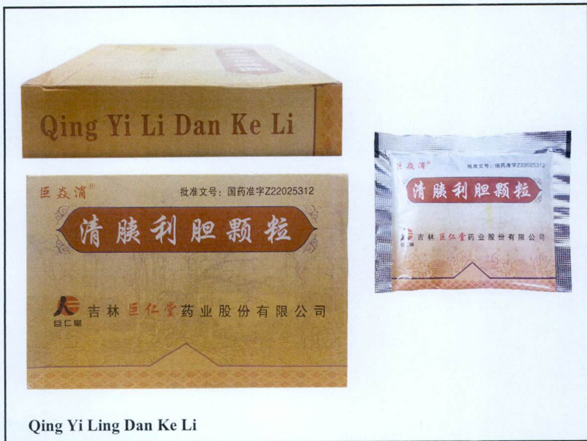
Qing Yi Ling Dan Ke Li

The Food and Drug Administration (FDA) advises the public against the purchase and use of the following unregistered drug products: