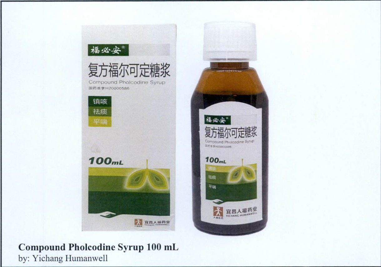
Compound Pholcodine Syrup 100 mL by: Yichang Humanwell