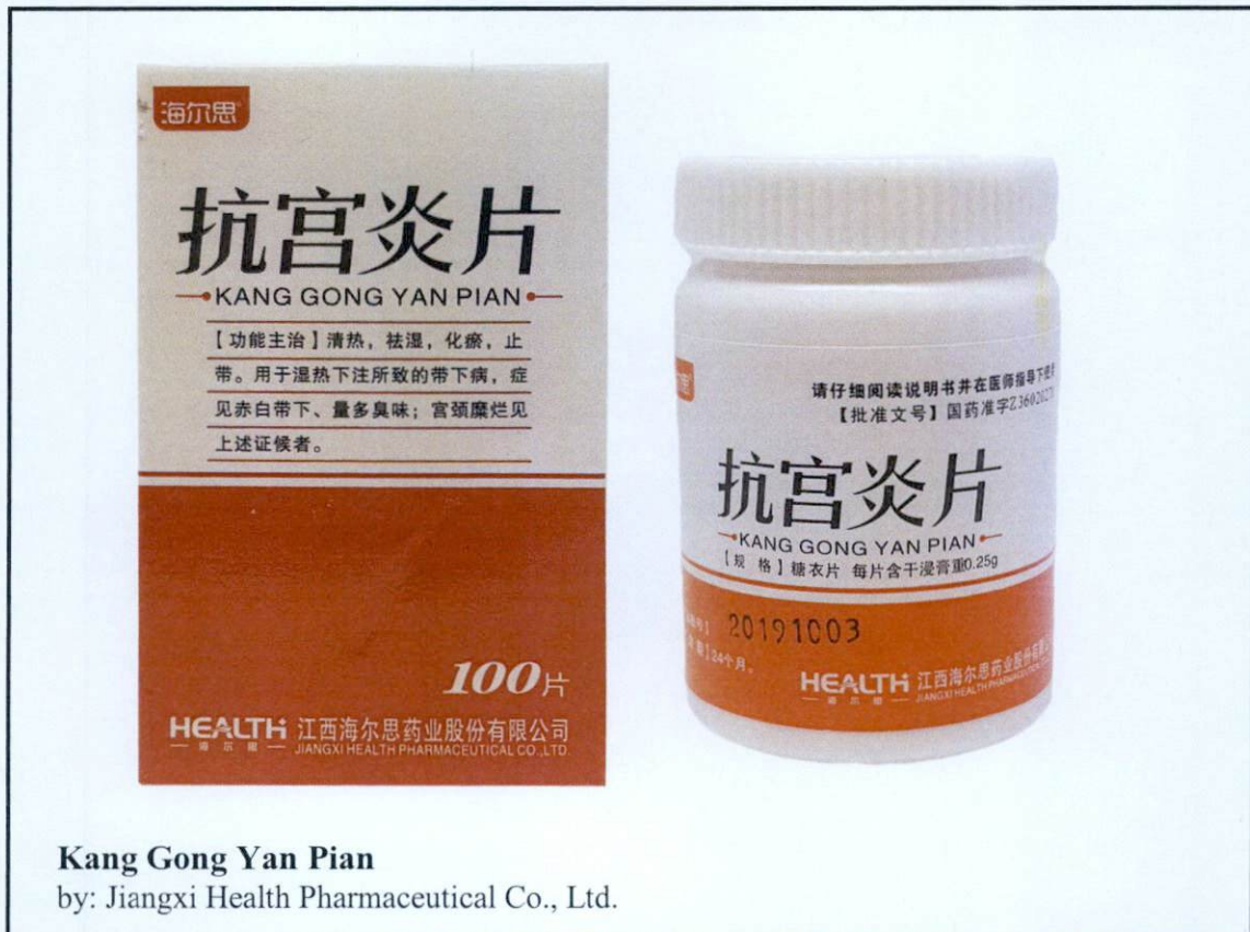
Kang Gong Yan Pian by: Jiangxi Health Pharmaceutical Co., Ltd.

The Food and Drug Administration (FDA) advises the public against the purchase and use of the following unregistered drug products: