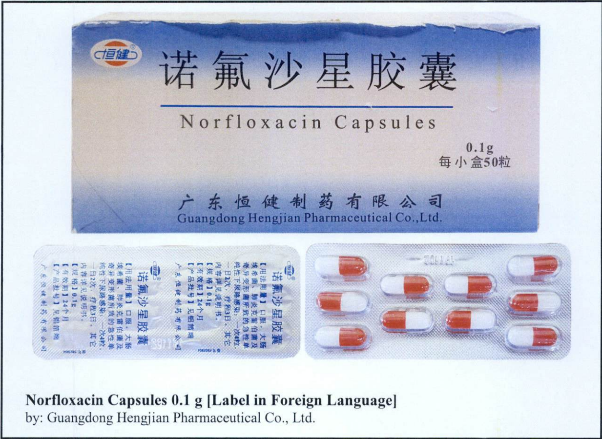
Norfloxacin Capsules 0.1 g [Label in Foreign Language] by: Guangdong Hengjian Pharmaceutical Co., Ltd.