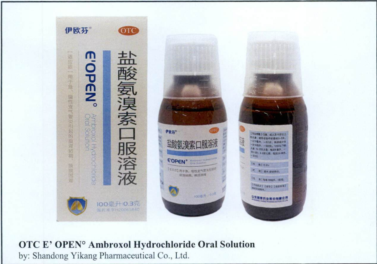
Figure 2. Unregistered drug