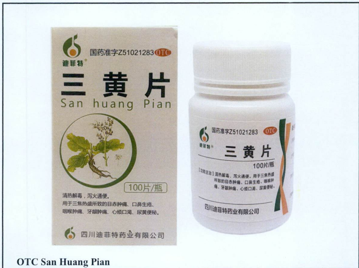
OTC San Huang Pian

The Food and Drug Administration (FDA) advises the public against the purchase and use of the following unregistered drug products: