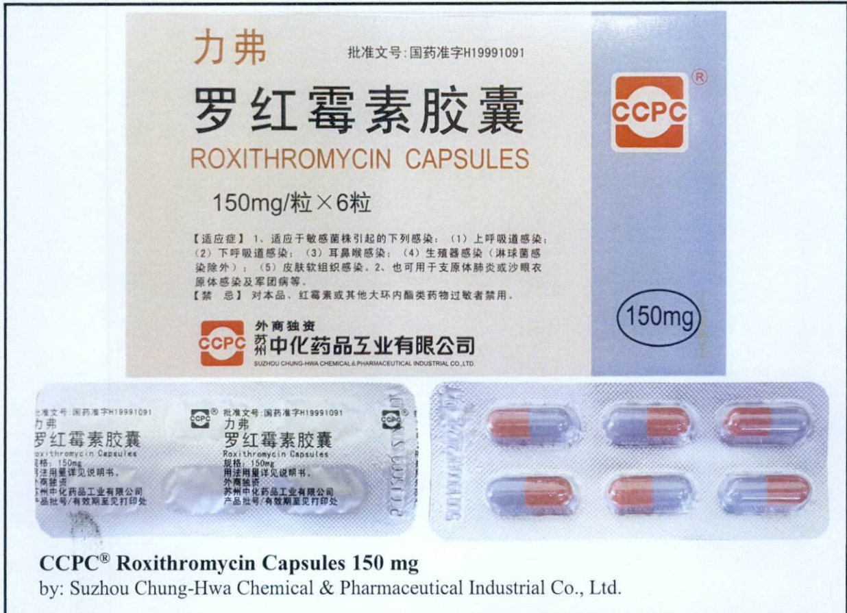
Figure 3. Unregistered drug