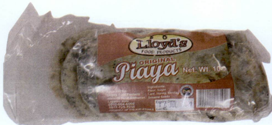
Figure 1. Unregistered LLOYD'S FOOD PRODUCTS Original Piaya

The Food and Drug Administration (FDA) warns all healthcare professionals and the general public NOT TO PURCHASE AND CONSUME the following unregistered food products: