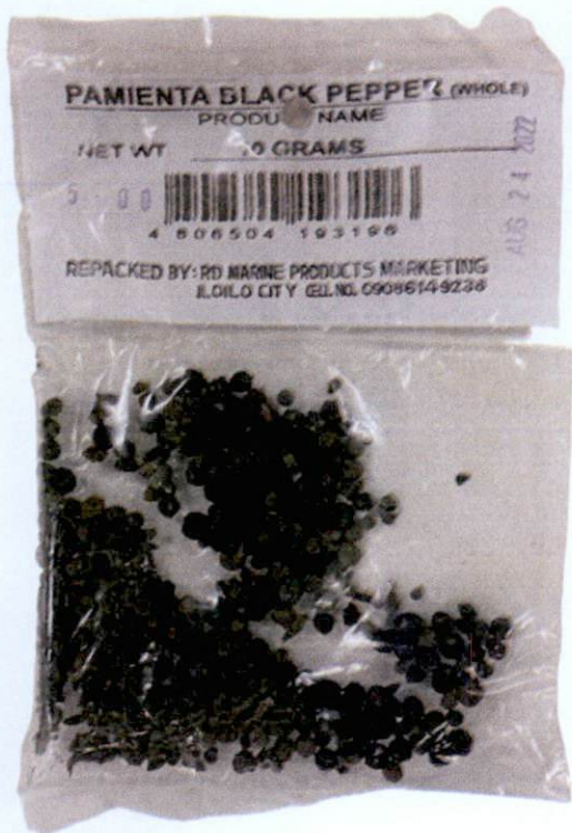
Figure 4. Unregistered RDM Pamienta Black Pepper (Whole), 10 g