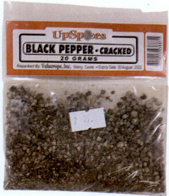
Figure 3. Unregistered UPSICES Black Pepper Cracked, 20 g