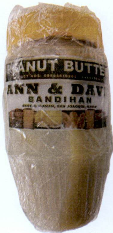
Figure 5. Unregistered ANN & DAVE Peanut Butter