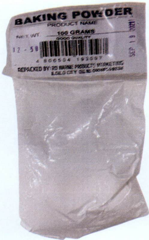
Figure 2. Unregistered RDM Baking Powder, 100 g