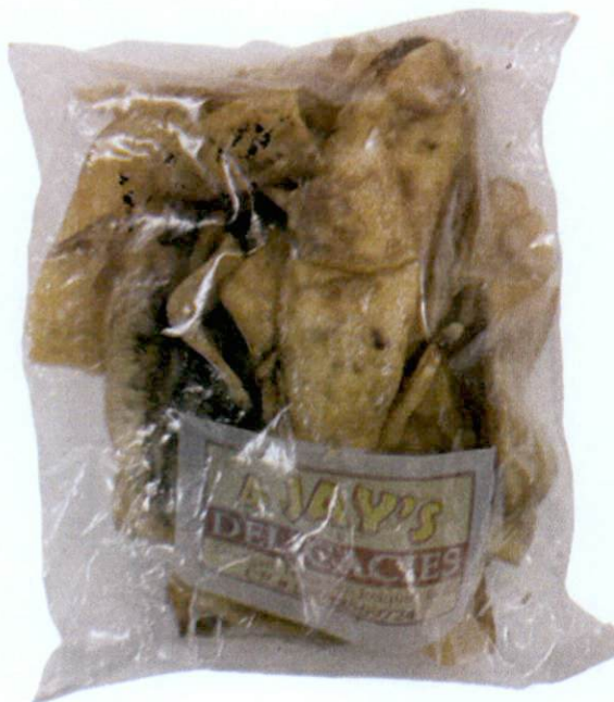
Figure 1. Unregistered 4 JAY'S DELICACIES Banana Chips

The Food and Drug Administration (FDA) warns all healthcare professionals and the general public NOT TO PURCHASE AND CONSUME the following unregistered food products: