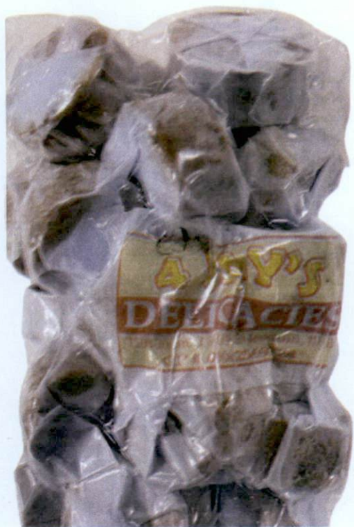
Figure 2. Unregistered 4 JAY'S DELICACIES Peanut Polvoron