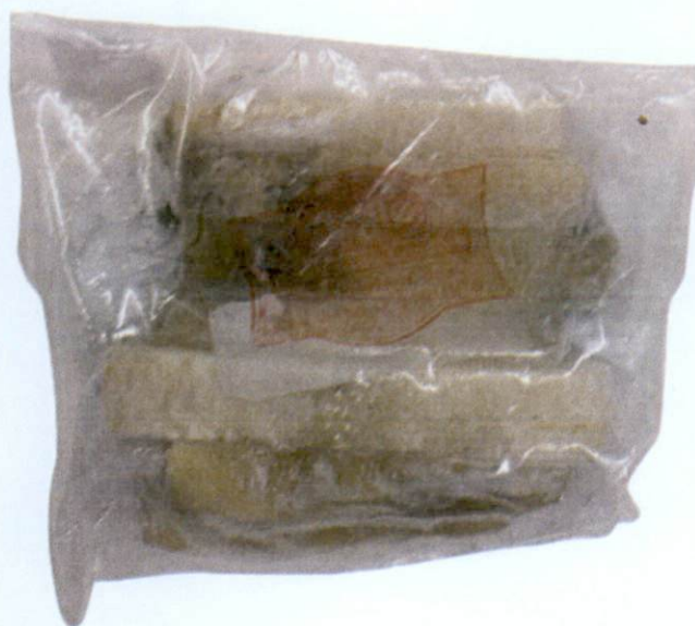
Figure 4. Unregistered ARGIE HOMEMADE CANDIES Coconut Bar