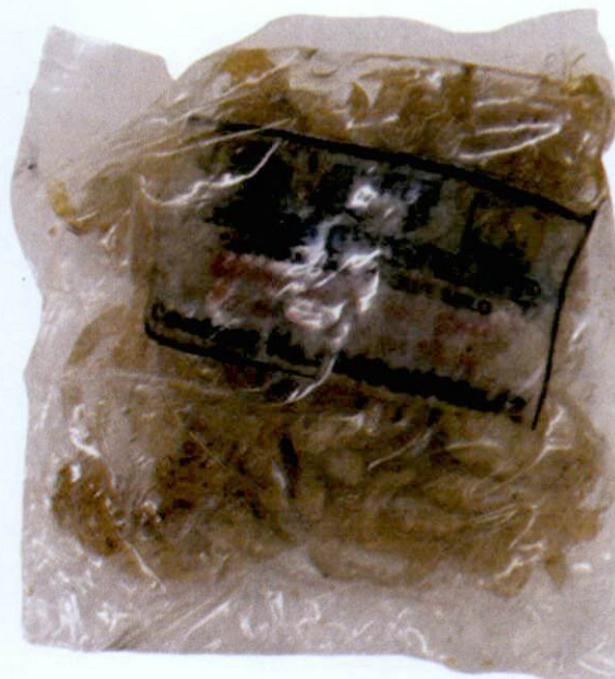
Figure 3. Unregistered 4 J'S SARABIA Bucayo