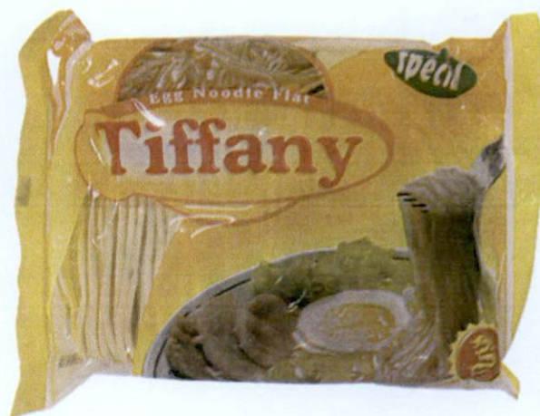
Figure 5. Unregistered TIFFANY Special Egg Noodle Flat