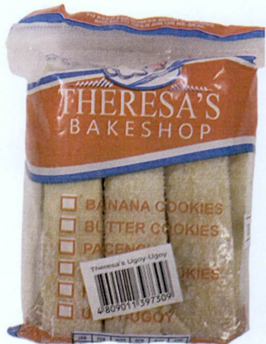
Figure 5. Unregistered THERESA'S BAKESHOP Ugly-Ugoy