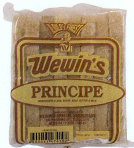
Figure 1. Unregistered WEWIN'S Principe Big

The Food and Drug Administration (FDA) warns all healthcare professionals and the general public NOT TO PURCHASE AND CONSUME the following unregistered food products: