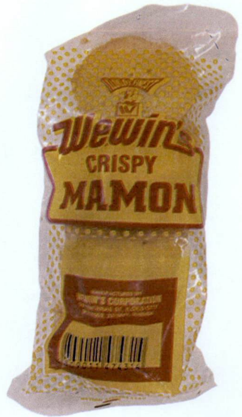
Figure 3. Unregistered WEWIN'S Crispy Mamon