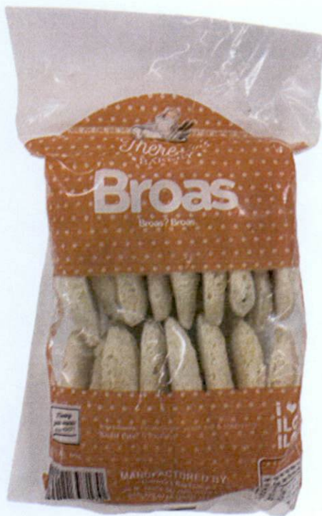
Figure 4. Unregistered THERESA'S BAKERY Broas