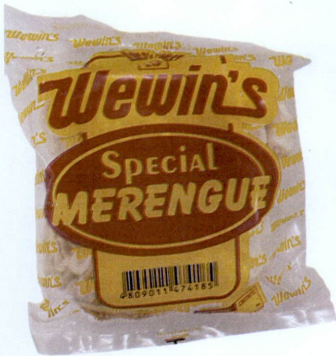
Figure 2. Unregistered WEWIN'S Special Merengue