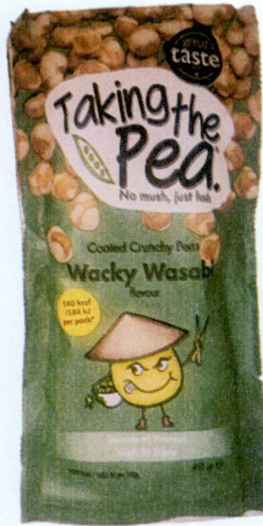
Figure 3. Unregistered TAKING THE PEA Coated Crunchy Peas Wacky Wasabi Flavor