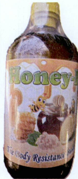
Figure 5. Unregistered HONEY-B