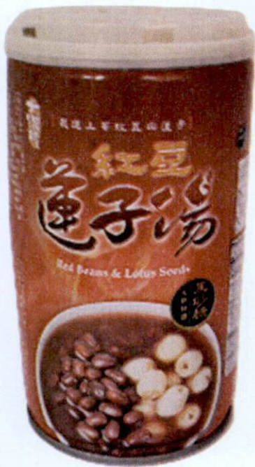
Figure 2. Unregistered Red Beans & Lotus Seeds in Red Can (In Foreign Language)