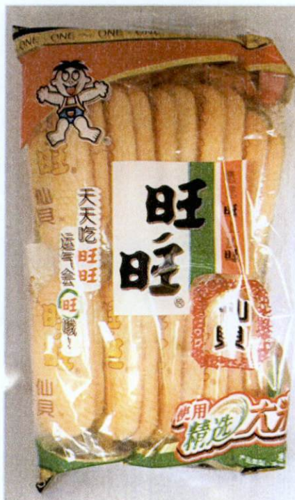
Figure 1. Unregistered ONE Assumed as Rice Snack in Transparent Plastic (In Foreign Language)

The Food and Drug Administration (FDA) warns all healthcare professionals and the general public NOT TO PURCHASE AND CONSUME the following unregistered food products: