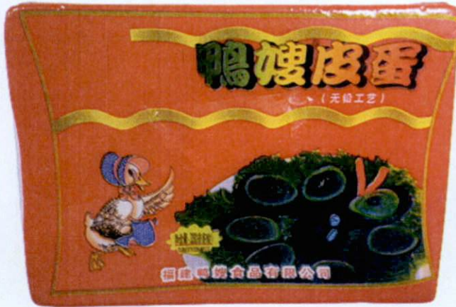
Figure 2. Unregistered Preserved Duck Eggs with Red Label In Foreign Language