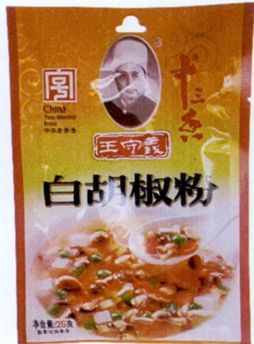
Figure 5. Unregistered CHINA TIME HONORED BRAND Assumed as Powdered Seasoning (In Foreign Language)