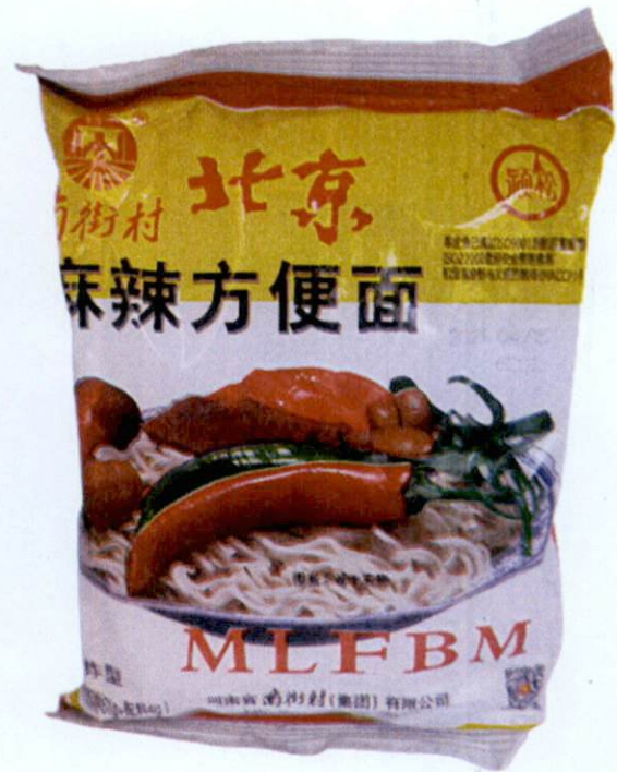
Figure 3. Unregistered MLFBM Instant Noodles with Image of Chili