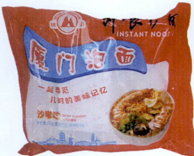
Figure 4. Unregistered DOUBLE MOUNTAIN Instant Noodles Satay Flavour