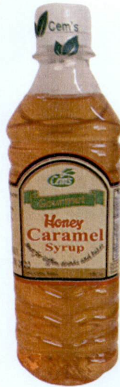
Figure 3. Unregistered CEM'S Gourmet Honey Caramel Syrup 500 ml