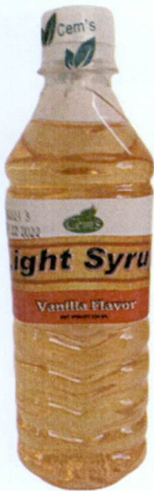
Figure 4. Unregistered CEM'S Light Syrup Vanilla Flavor 530 ml