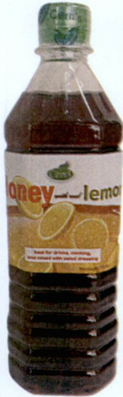
Figure 2. Unregistered CEM'S Honey with Real Lemon 750 ml