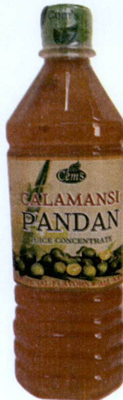
Figure 1. Unregistered CEM'S Calamansi Pandan Juice Concentrate 750 ml

The Food and Drug Administration (FDA) warns all healthcare professionals and the general public NOT TO PURCHASE AND CONSUME the following unregistered food products: