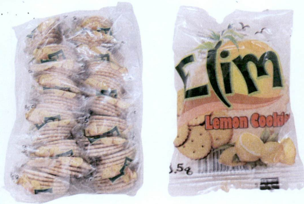
Figure 2. Unregistered ELIM Lemon Cookies