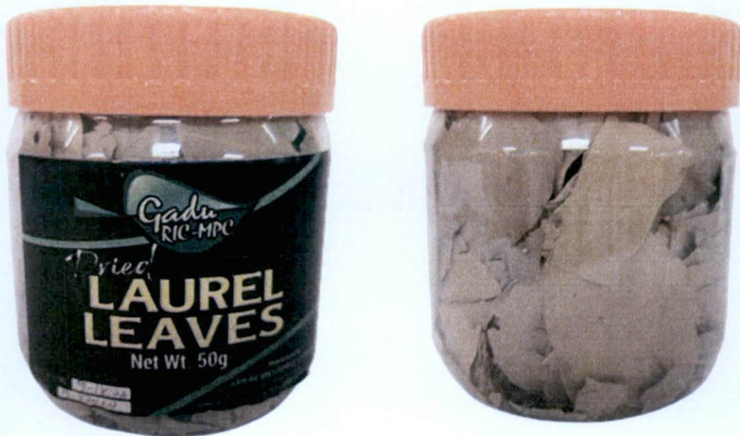
Figure 3. Unregistered GADU RIC-MPC Dried Laurel Leaves