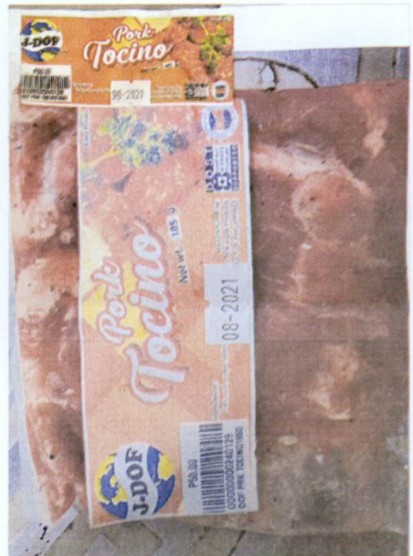
Figure 5. Unregistered J-DOF Pork Tocino, 185 g