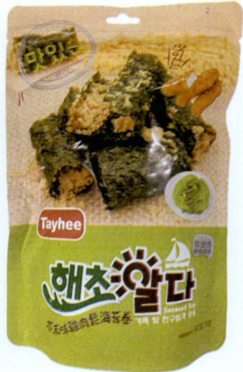
Figure 3. Unregistered TAYHEE Seaweed Roll in a Cream and Green-colored resealable plastic (Labels are in foreign characters)