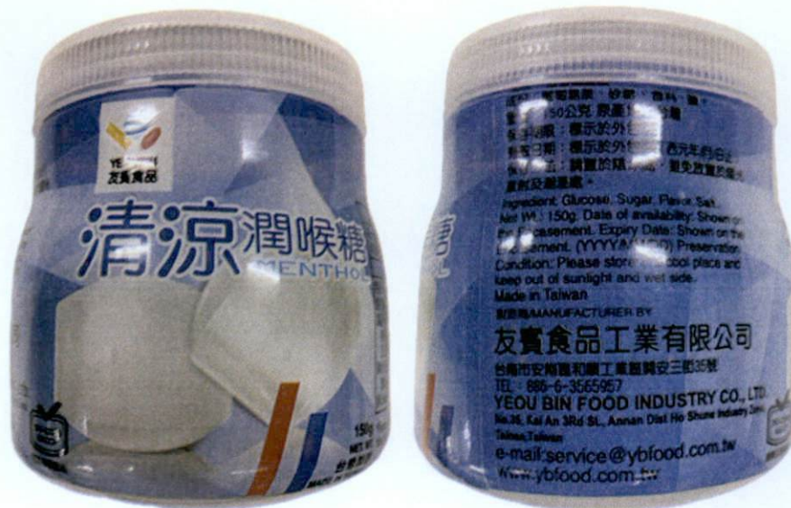
Figure 1. Unregistered YEYOU BIN Menthol in a plastic container with Blue label and an image of clear Candy (Labels are in foreign characters)

The Food and Drug Administration (FDA) warns all healthcare professionals and the general public NOT TO PURCHASE AND CONSUME the following unregistered food products: