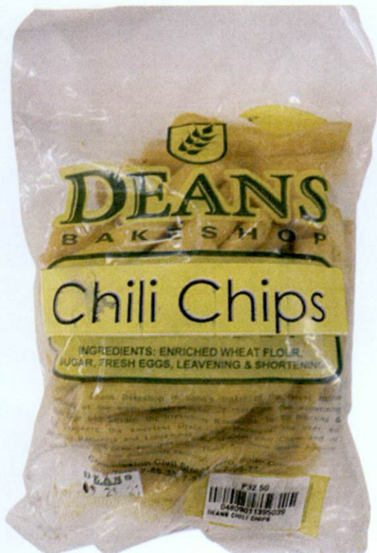
Figure 4. Unregistered DEANS BAKESHOP Chili Chips