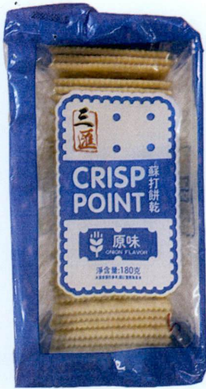
Figure 2. Unregistered Crisp Point Onion Flavor in a Blue-colored transparent plastic packaging, 180 g (Labels are in foreign characters)