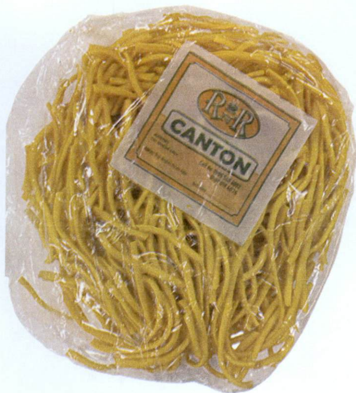
Figure 4. Unregistered RNR Canton