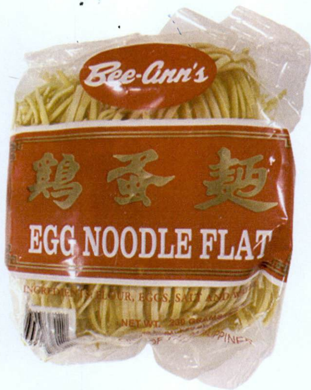
Figure 2. Unregistered BEE-ANN'S Egg Noodle Flat, 230 g