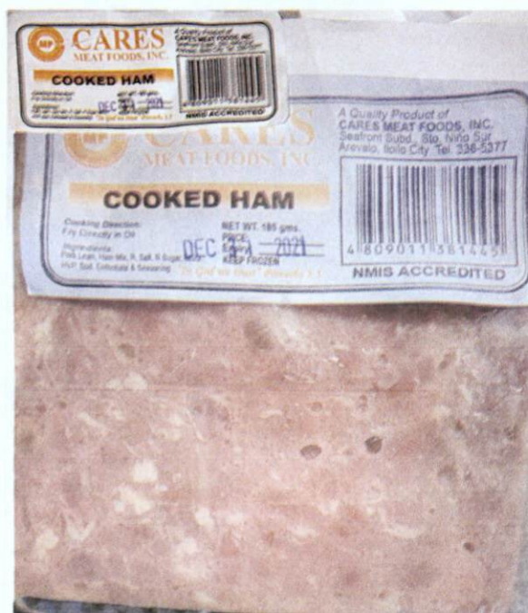
Figure 1. Unregistered CARES MEAT FOODS, INC., Cooked Ham, 185 g

The Food and Drug Administration (FDA) warns all healthcare professionals and the general public NOT TO PURCHASE AND CONSUME the following unregistered food products: