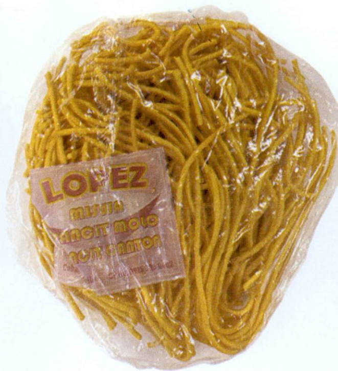
Figure 3. Unregistered LOPEZ Pancit Canton