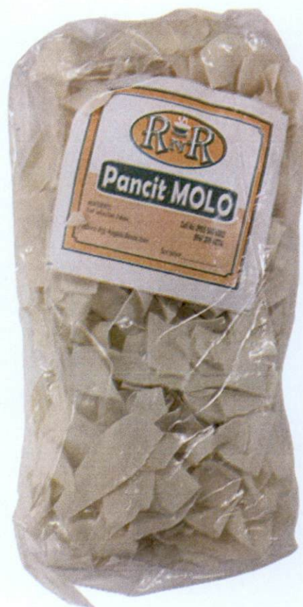
Figure 5. Unregistered RNR Pancit Molo