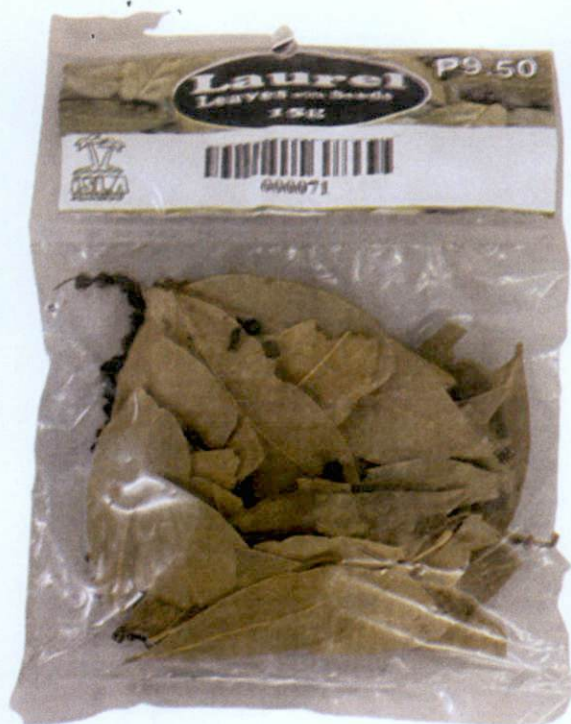
Figure 2. Unregistered ISLA Laurel Leaves with Seeds, 15g