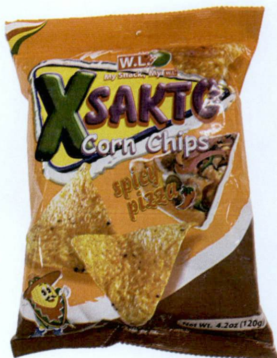
Figure 5. Unregistered W.L. XSakto Corn Chips Spicy Pizza, 120 g