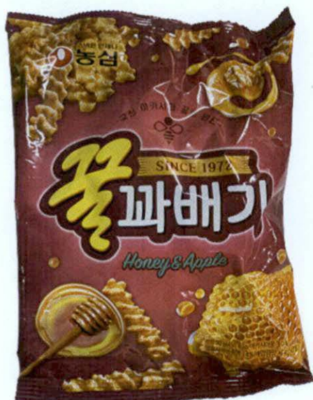
Figure 1. Unregistered Since 1972 Honey & Apple in a Pink pouch with image of Honey (Labels are in foreign characters)

The Food and Drug Administration (FDA) warns all healthcare professionals and the general public NOT TO PURCHASE AND CONSUME the following unregistered food products and food supplement: