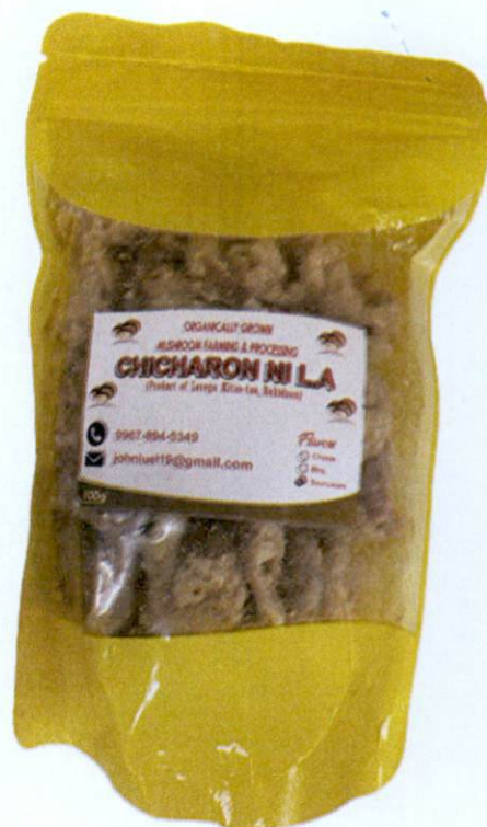
Figure 3. Unregistered MUSHROOM FARMING & PROCESSING Chicharon ni LA