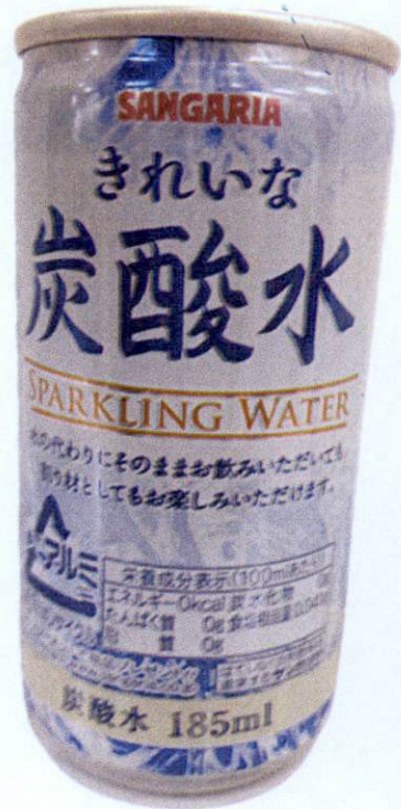
Figure 3. Unregistered SANGARIA Sparkling Water in a White and Blue-colored Tin Can (Labels are in foreign characters)