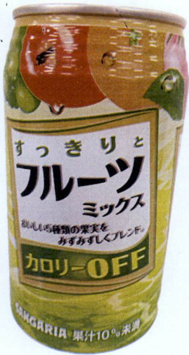
Figure 2. Unregistered SANGARIA in a Green-colored Tin Can with images of Orange and Apple (Labels are in foreign characters)