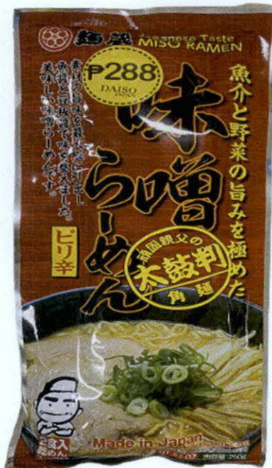
Figure 1. Unregistered JAPANESE TASTE Miso Ramen in a Red-colored pouch (Labels are in foreign characters)

The Food and Drug Administration (FDA) warns all healthcare professionals and the general public NOT TO PURCHASE AND CONSUME the following unregistered food products and food supplements: