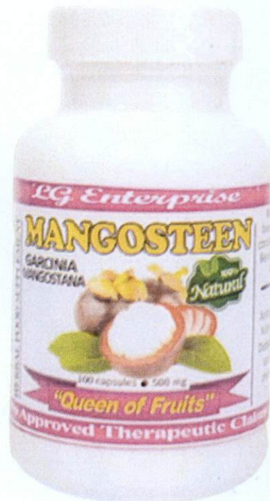
Figure 5. Unregistered LG ENTERPRISE Mangosteen, 500 mg 100 capsules