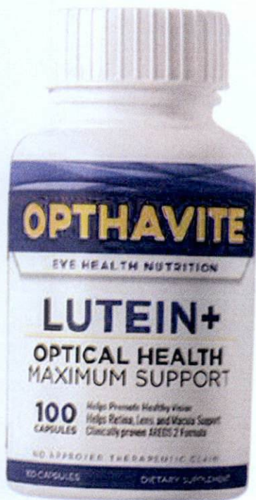
Figure 4. Unregistered OPTHAVITE Lutein+, 100 capsules