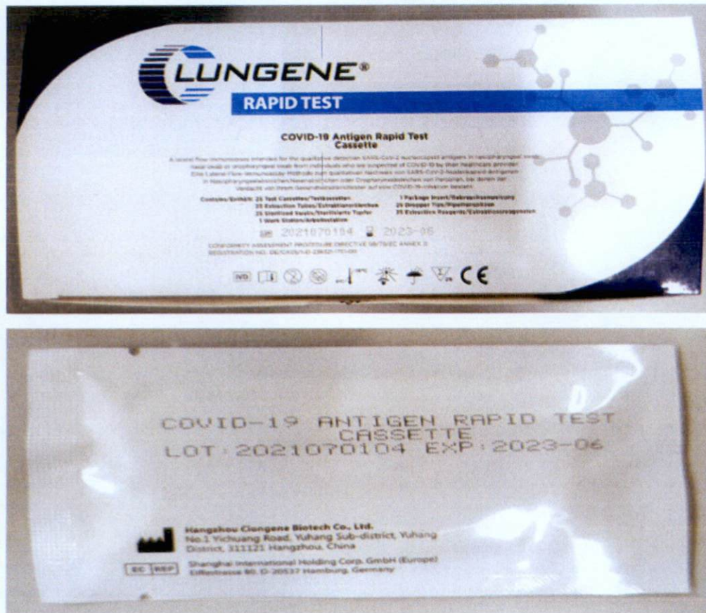
Figure 1. Uncertified Clungene Rapid Test Covid-19 Antigen Rapid Test Cassette

The Food and Drug Administration (FDA) warns all healthcare professionals and the general public NOT TO PURCHASE AND USE the uncertified COVID-19 test kit: