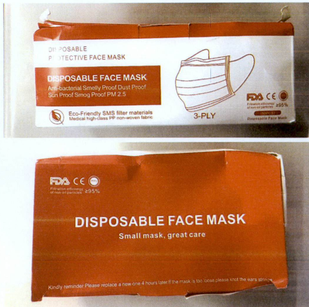
Figure 1. Unnotified Disposable Face Mask

The Food and Drug Administration (FDA) warns all healthcare professionals and the general public NOT TO PURCHASE AND USE the unnotified medical device product: