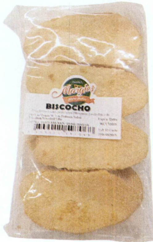
Figure 4. Unregistered MARGIES FILIPINO PASTRIES Biscocho