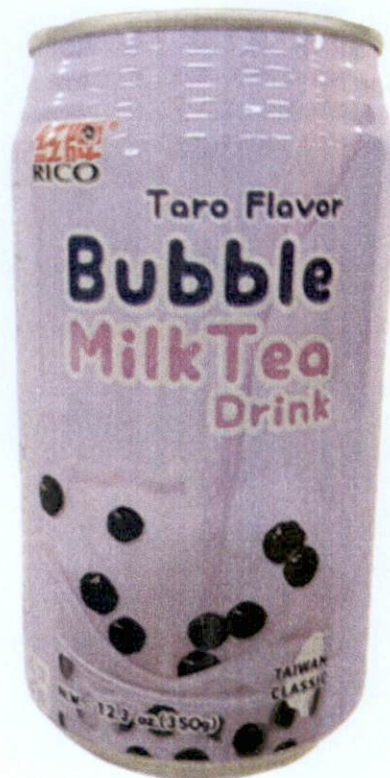
Figure 1. Unregistered RICO Bubble Milk Tea Drink Taro Flavor

The Food and Drug Administration (FDA) warns all healthcare professionals and the general public NOT TO PURCHASE AND CONSUME the following unregistered food products: