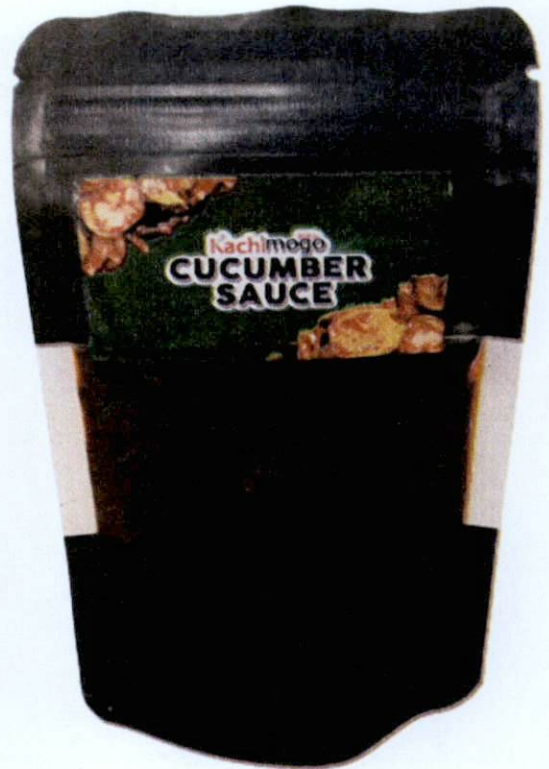
Figure 3. Unregistered KACHIMOGO Cucumber Sauce