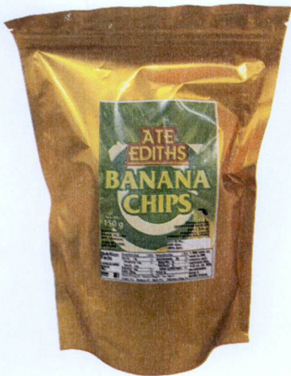
Figure 2. Unregistered ATE EDITHS Banana Chips