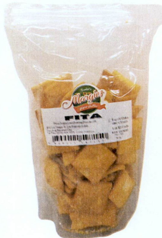
Figure 1. Unregistered MARGIES FILIPINO PASTRIES Fita

The Food and Drug Administration (FDA) warns all healthcare professionals and the general public NOT TO PURCHASE AND CONSUME the following unregistered food products: