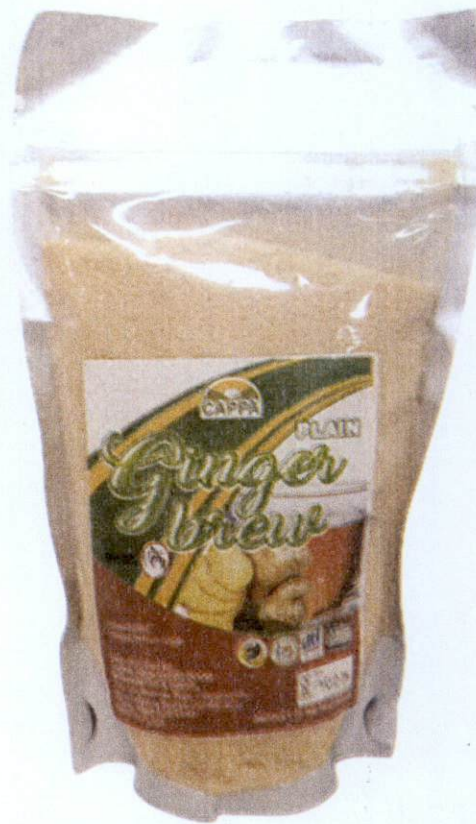
Figure 5. Unregistered CAPPAS Ginger Brew Plain