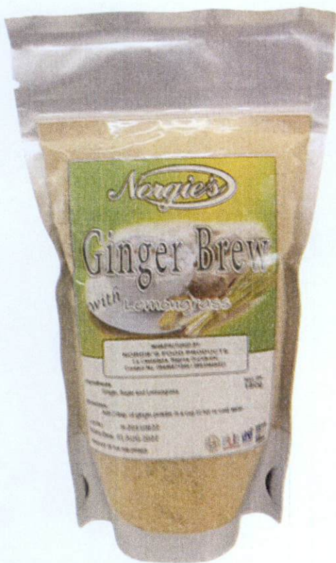
Figure 4. Unregistered NORGIE'S Ginger Brew with Lemongrass