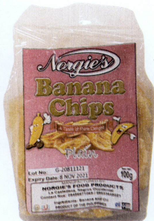
Figure 3. Unregistered NORGIE'S Banana Chips Plain