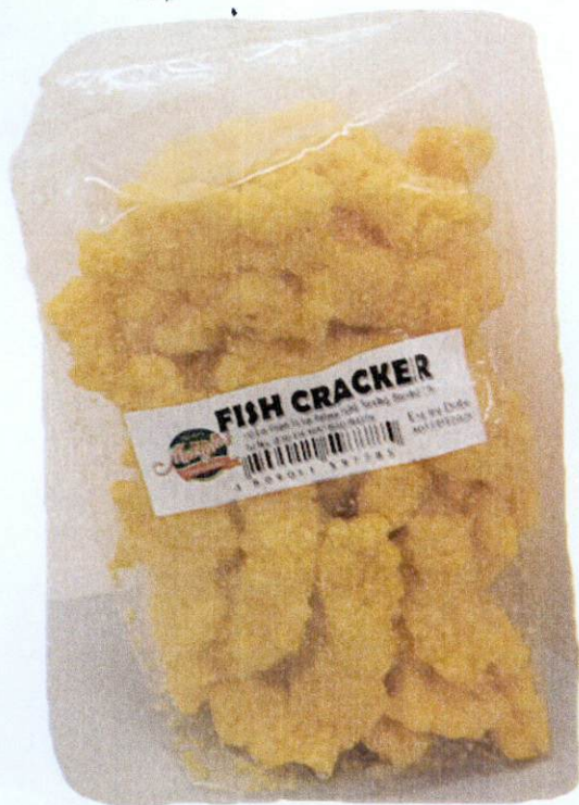
Figure 2. Unregistered MARGIES FILIPINO PASTRIES Fish Cracker